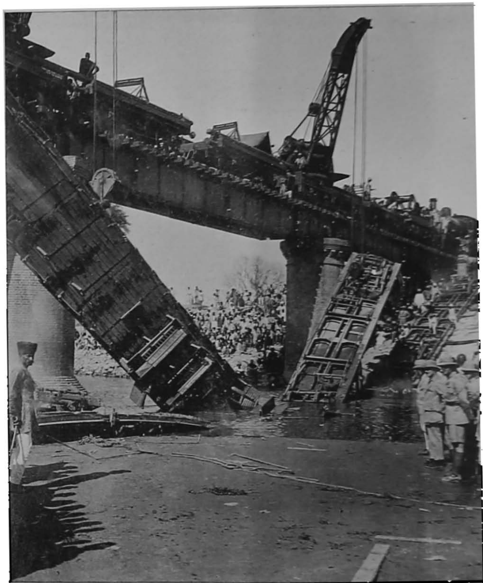
Tornado destruction: train blown off bridge.