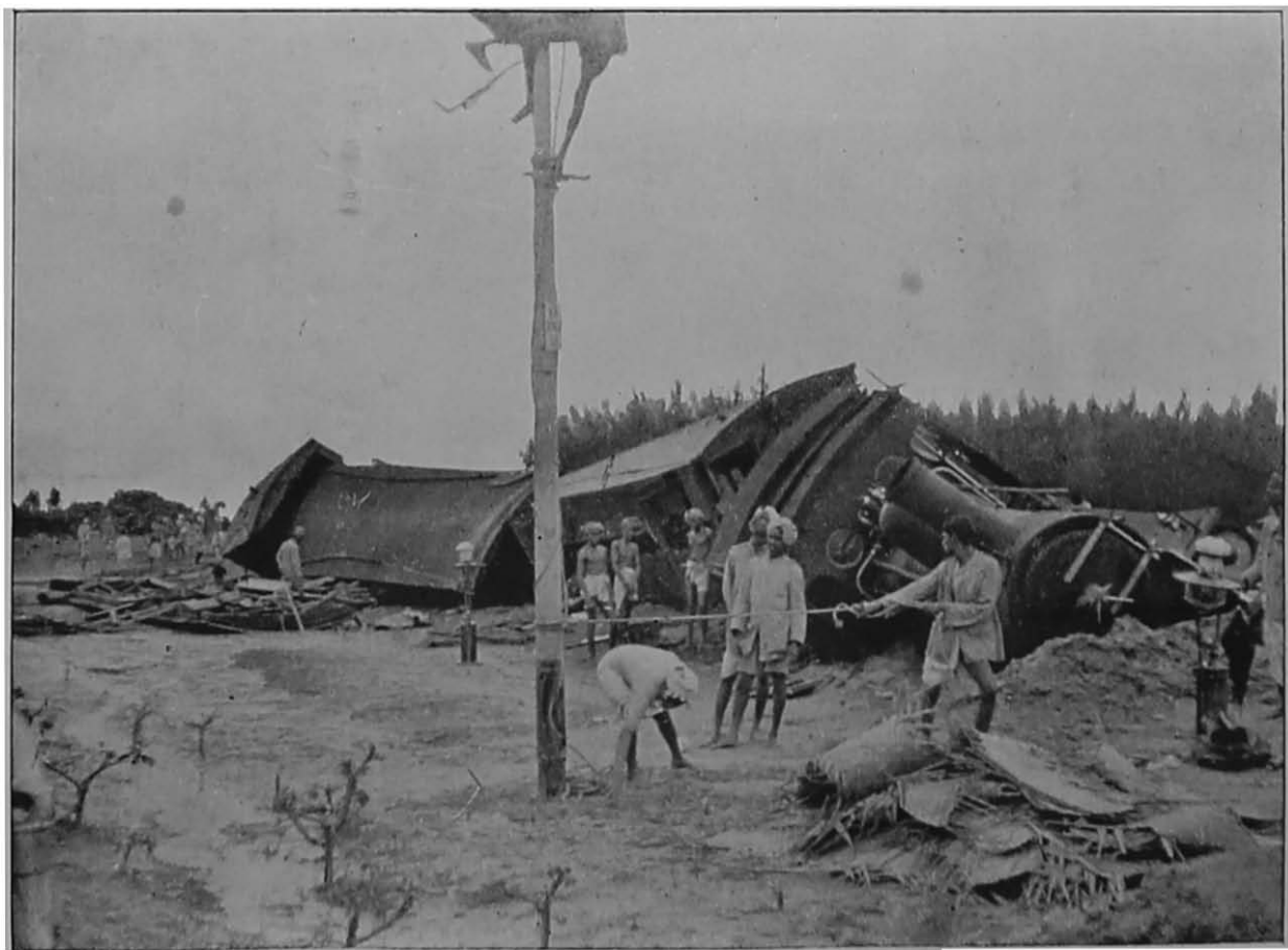
Flood destruction; line breached.