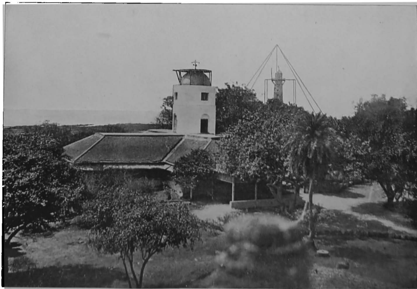
COLABA OBSERVATORY BOMBAY.