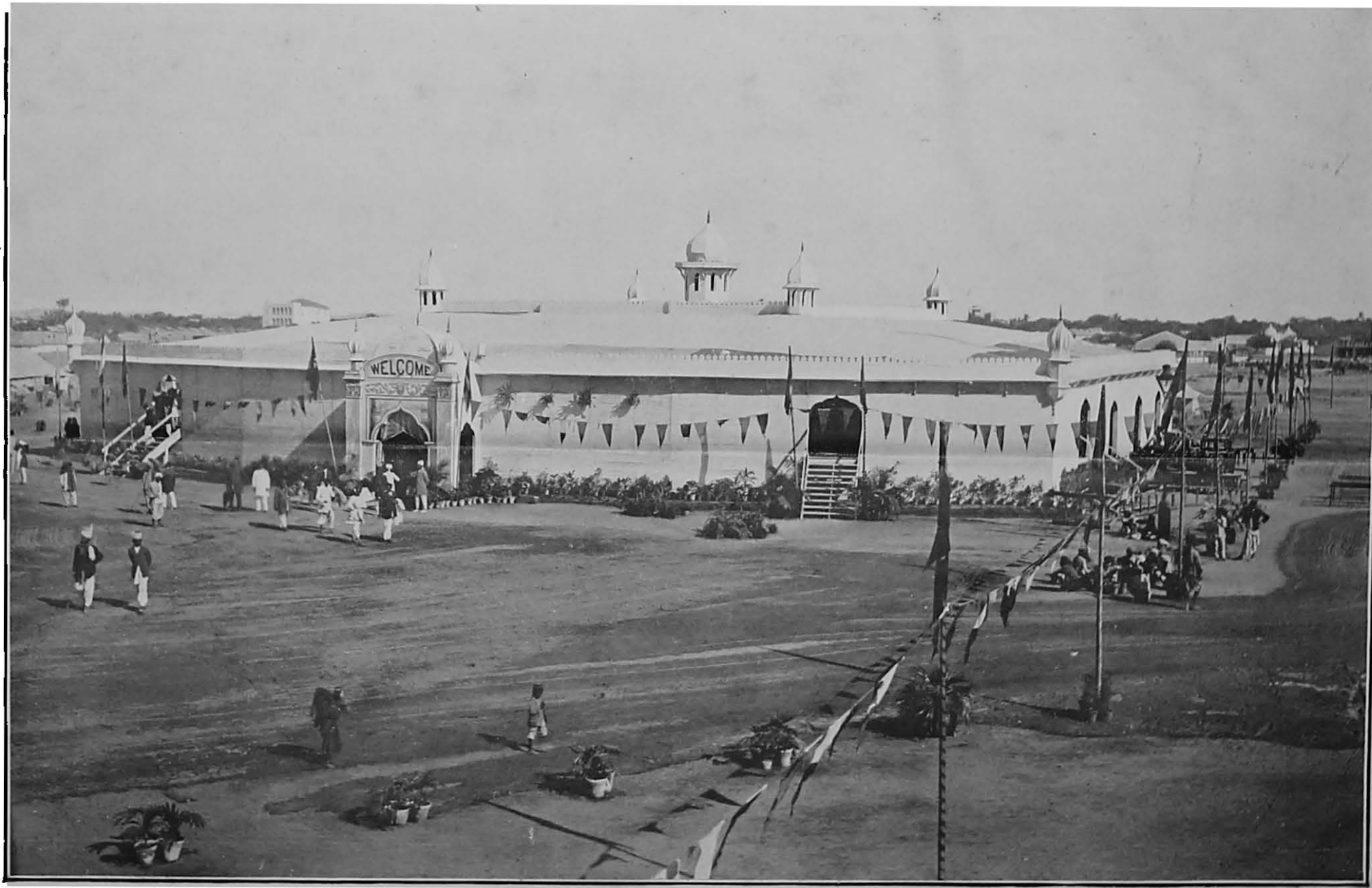
CONGRESS PANDAL, KARACHI, (1913).