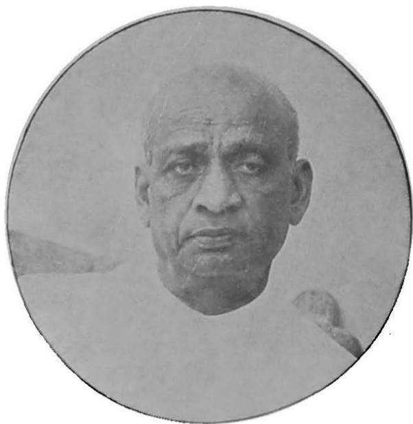
SARDAR VALLABHIBHAI PATEL