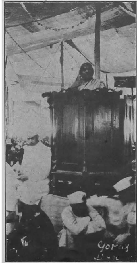
Mrs. Sarojini Naidu in the Rostrum.