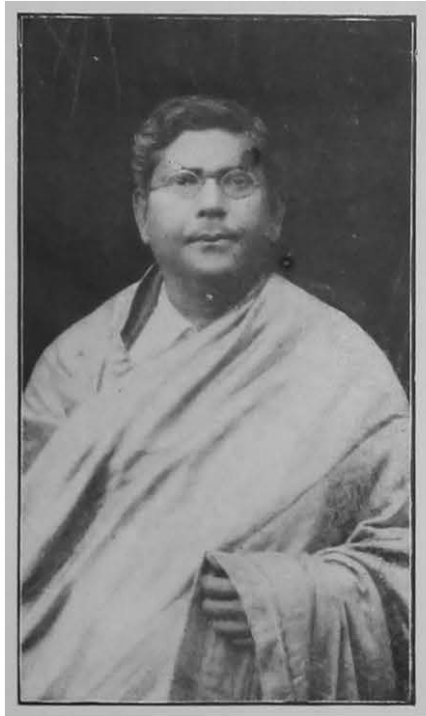
Deshbandhu Chitranjan Das, President, 37th Indian National Congress, GAYA.