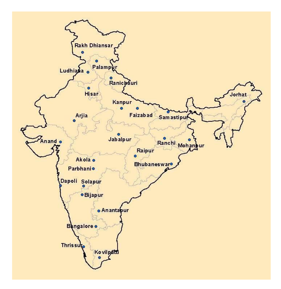
FIGURE 2: MAP SHOWING SPATIAL DISTRIBUTION OF SELECTED METEOROLOGICAL OBSERVATORIES IN THE COUNTRY