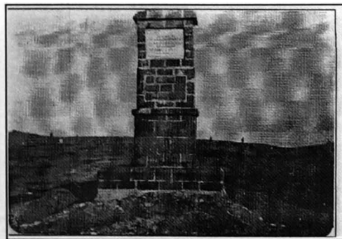
Plaque on Fergusson Hill (Hunuman Tekdi) where Gokhale alongwith three colleagues took oath to serve the people and founded Servants of India Society on June 12, 1905