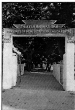
Rayagada Centre, Orissa