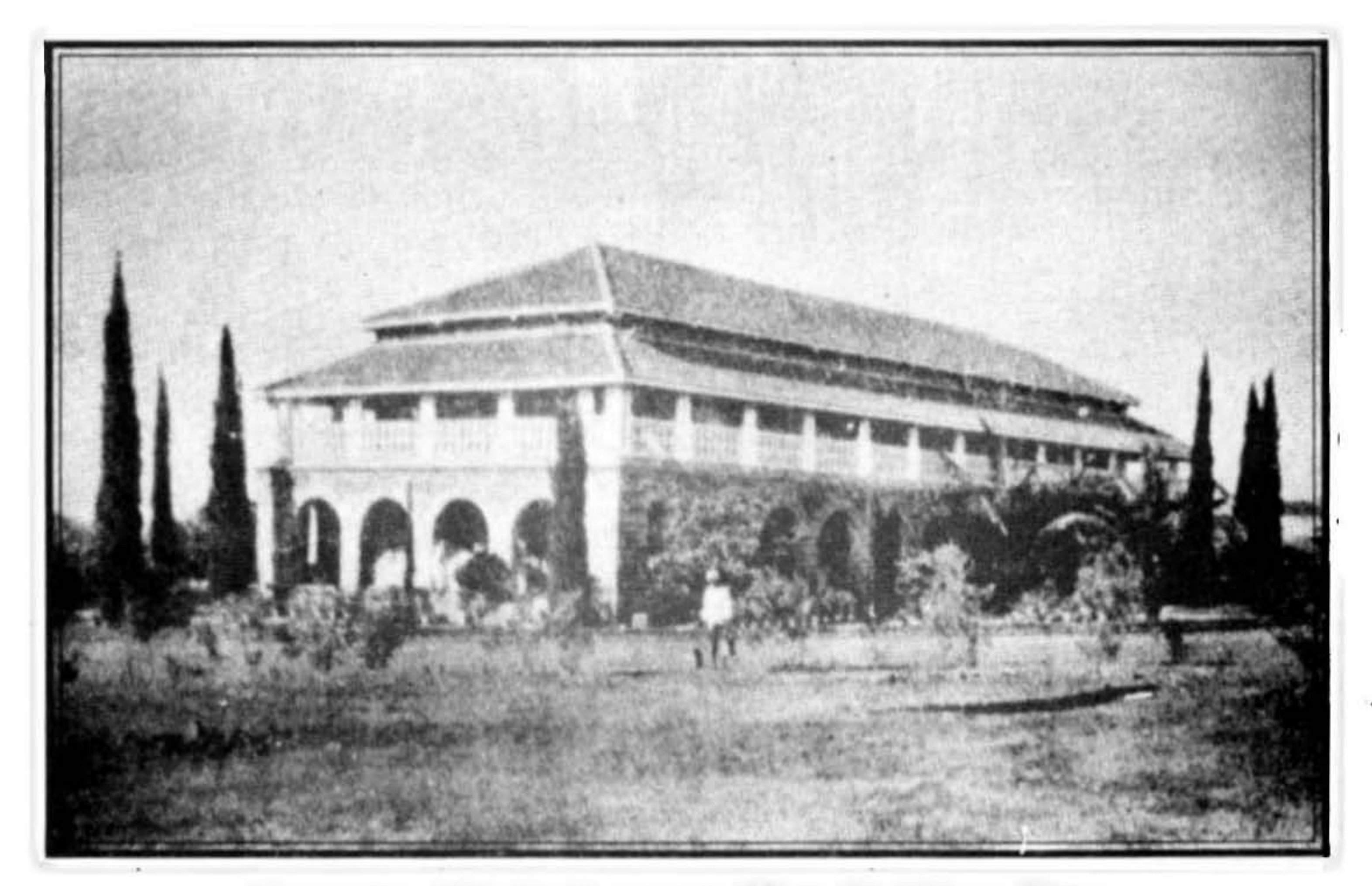
Servants of India Society's Main Building, Pune.