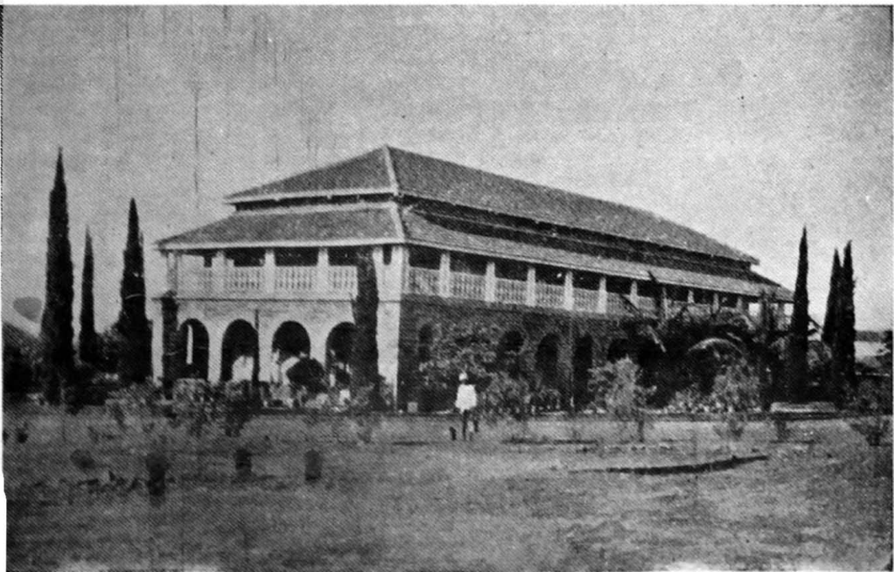
Servants of India Society's Main Building ( Pune )