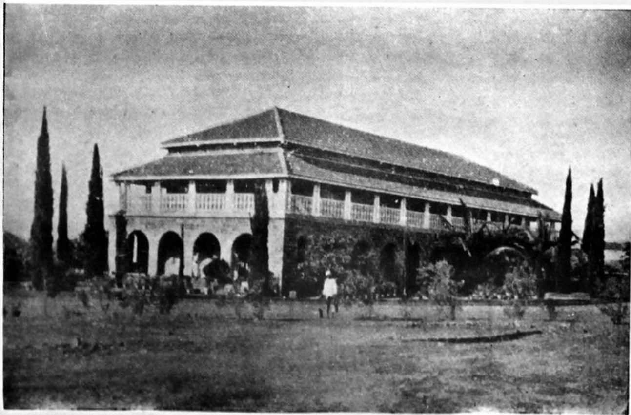
Servants of India Society's Main Building ( Pune )