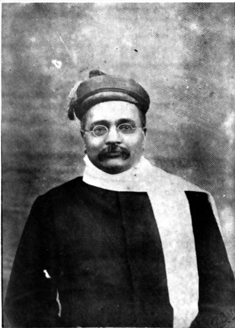
FOUNDER The Servants of India Society