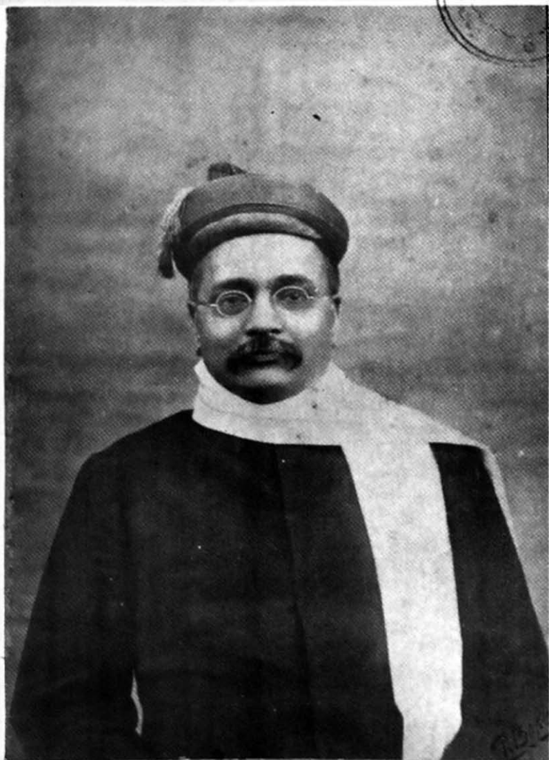
FOUNDER The Servants of India Society