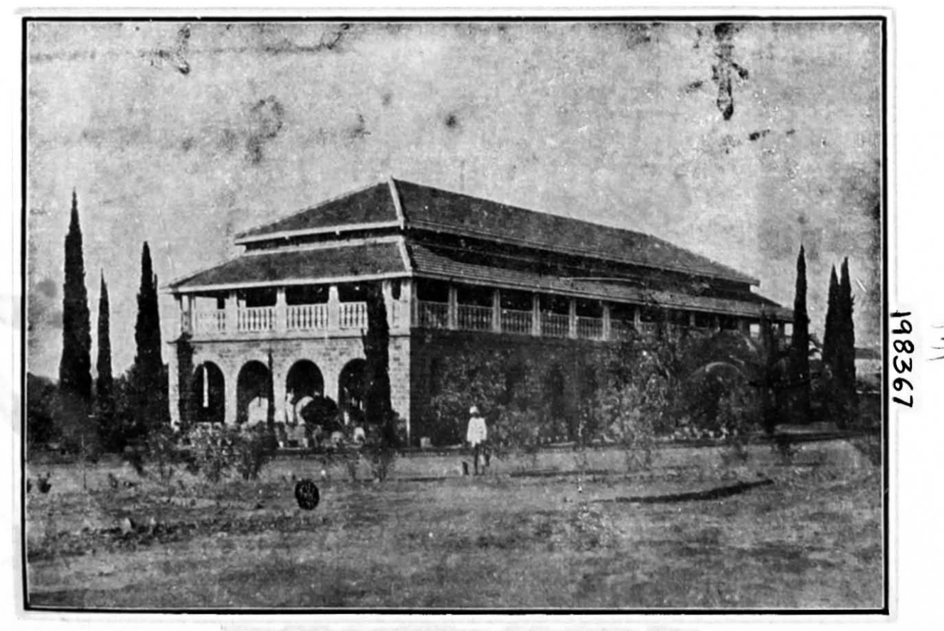
View of the Central Library of the Society, Pune