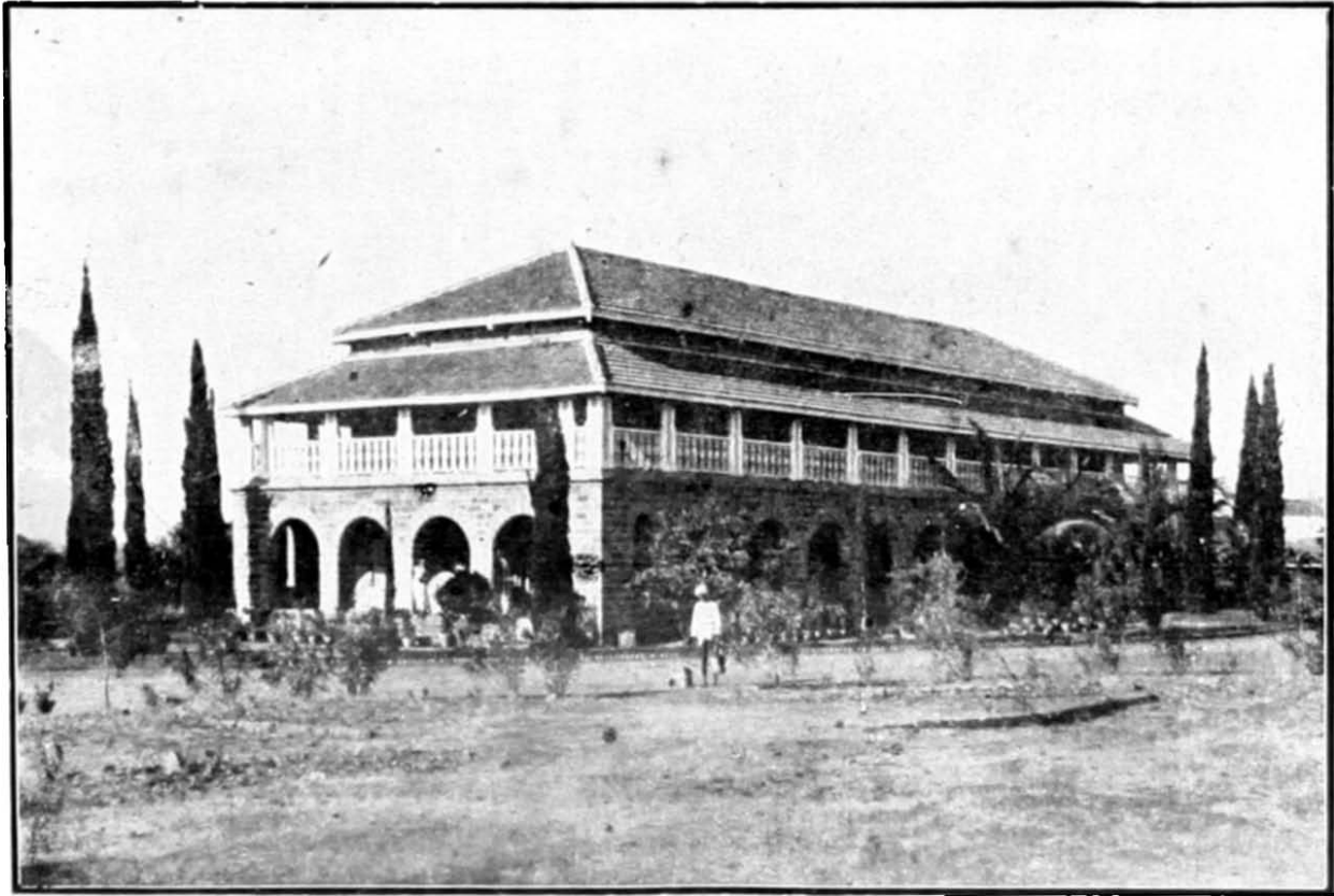
View of the Central Library of the Society, Poona.