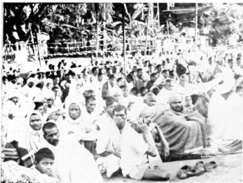
A Section of the audience at the Mirzapur Adivasi Conference. 22-1-1971