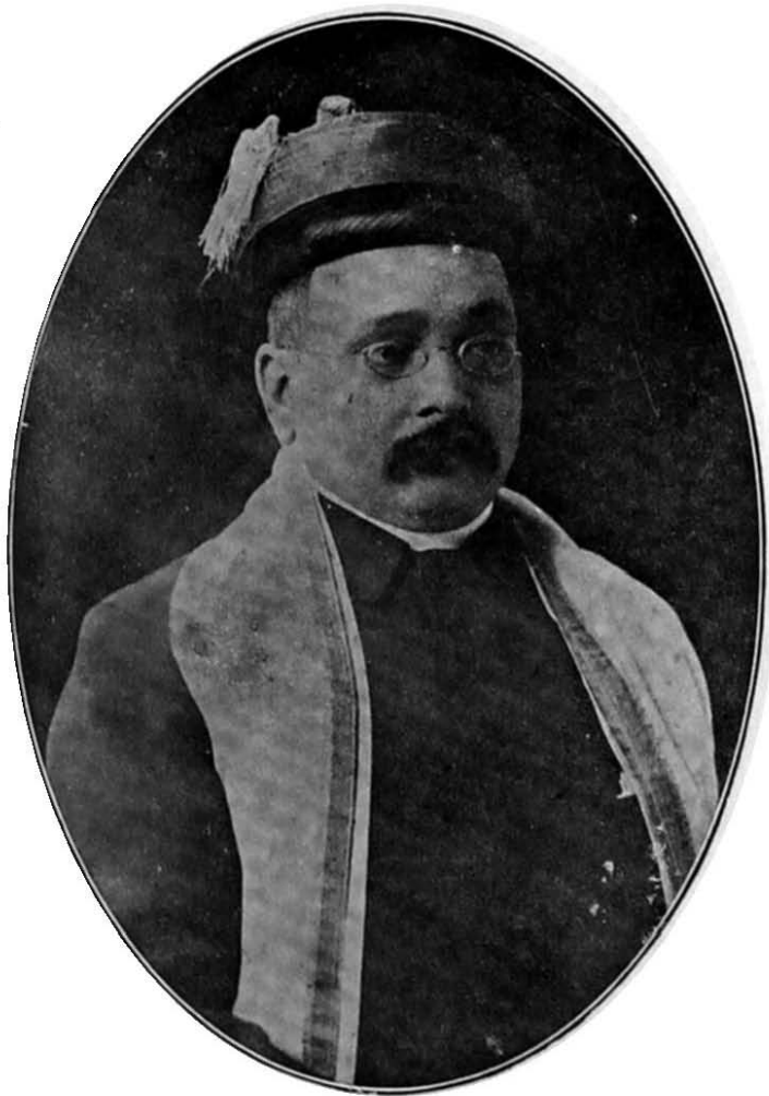
FOUNDER The Servants of India Society