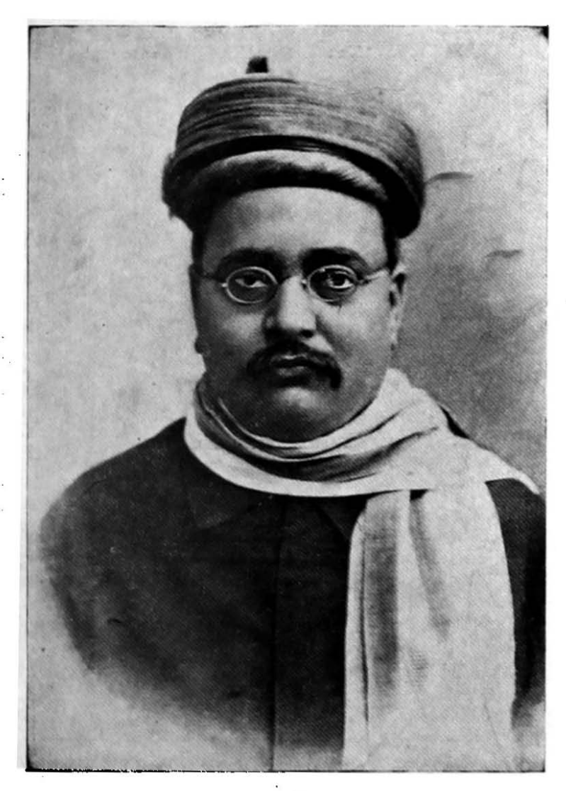
Founders. The Servants of India Society.