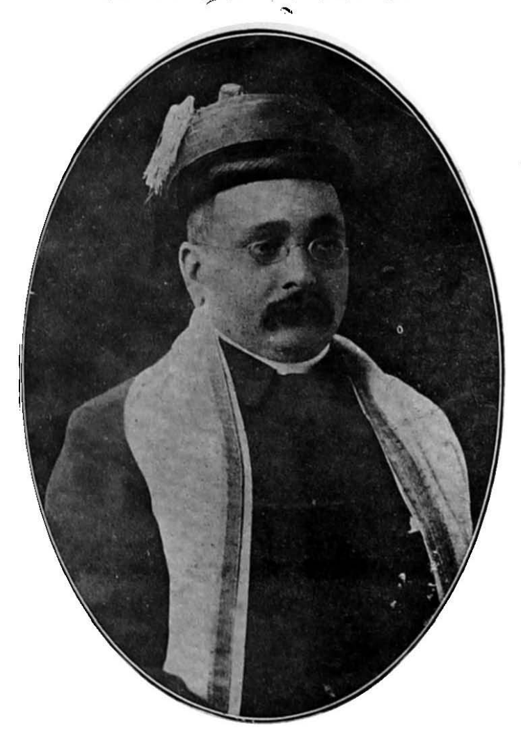
FOUNDER The Servants of India Society