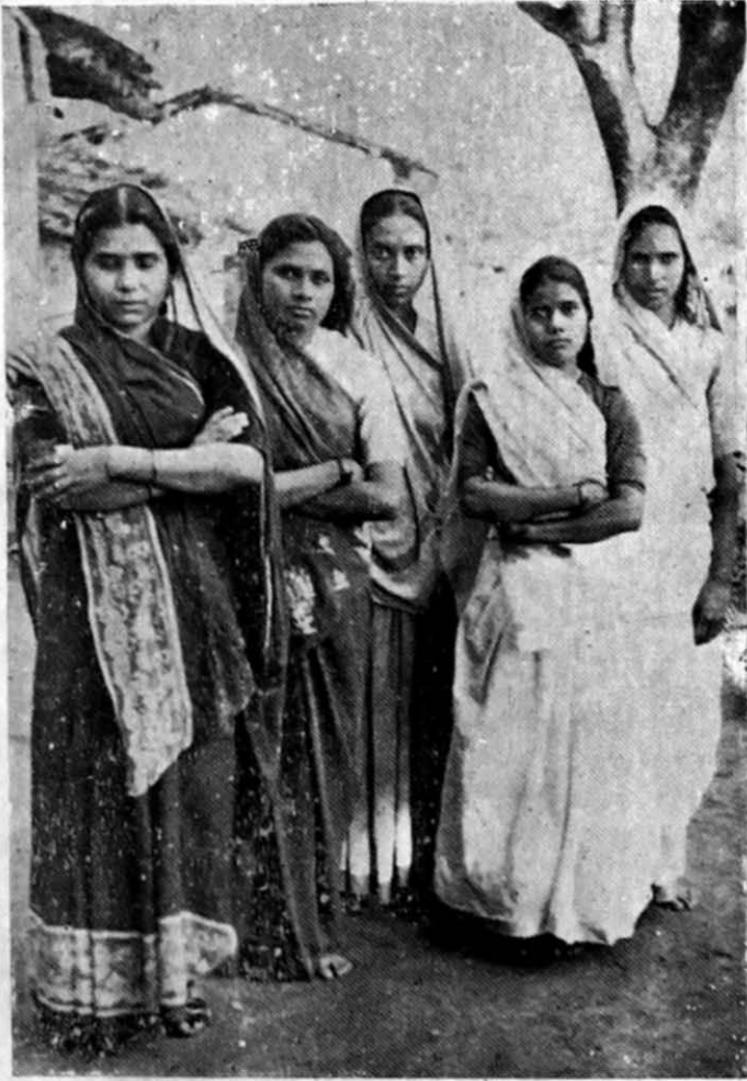
Students of Women's Welfare Centre, Dudhi, who received prizes for their good work