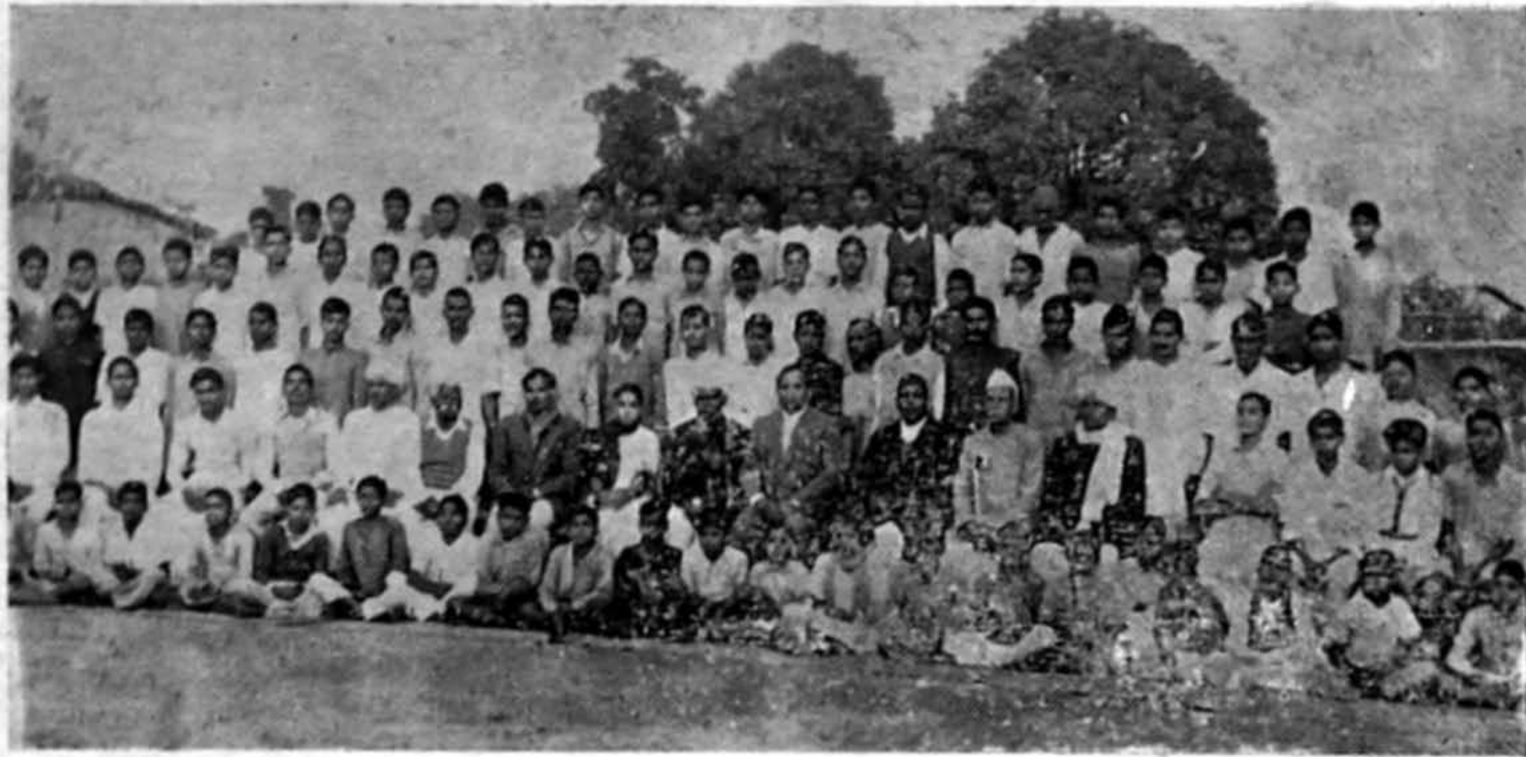
Students of the Junior High School, Salkhan, who secured 1st position for their School in the Department Examinations.