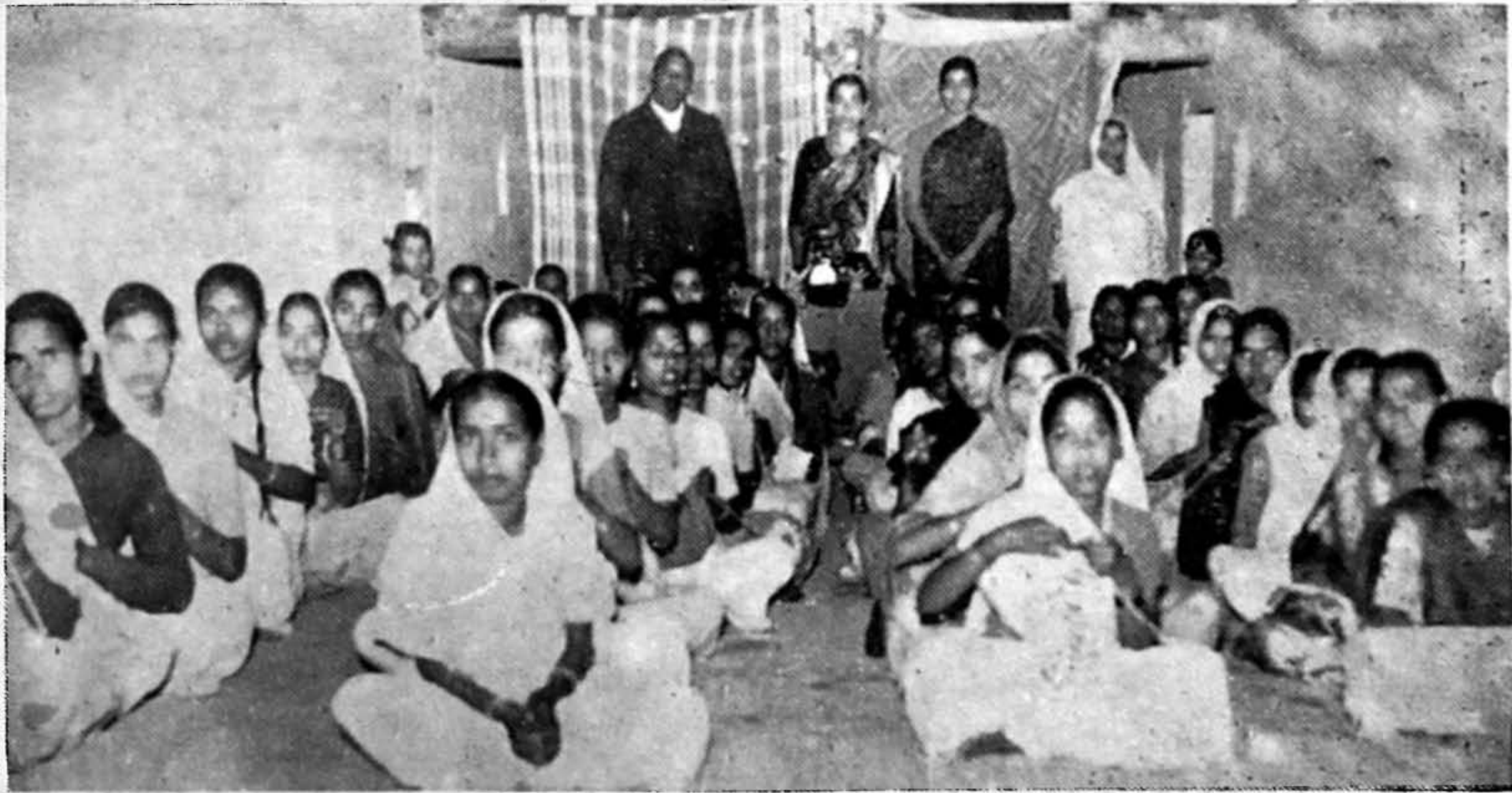
Students of the Women's Welfare Centre, Dudhi, in a Knitting Class.