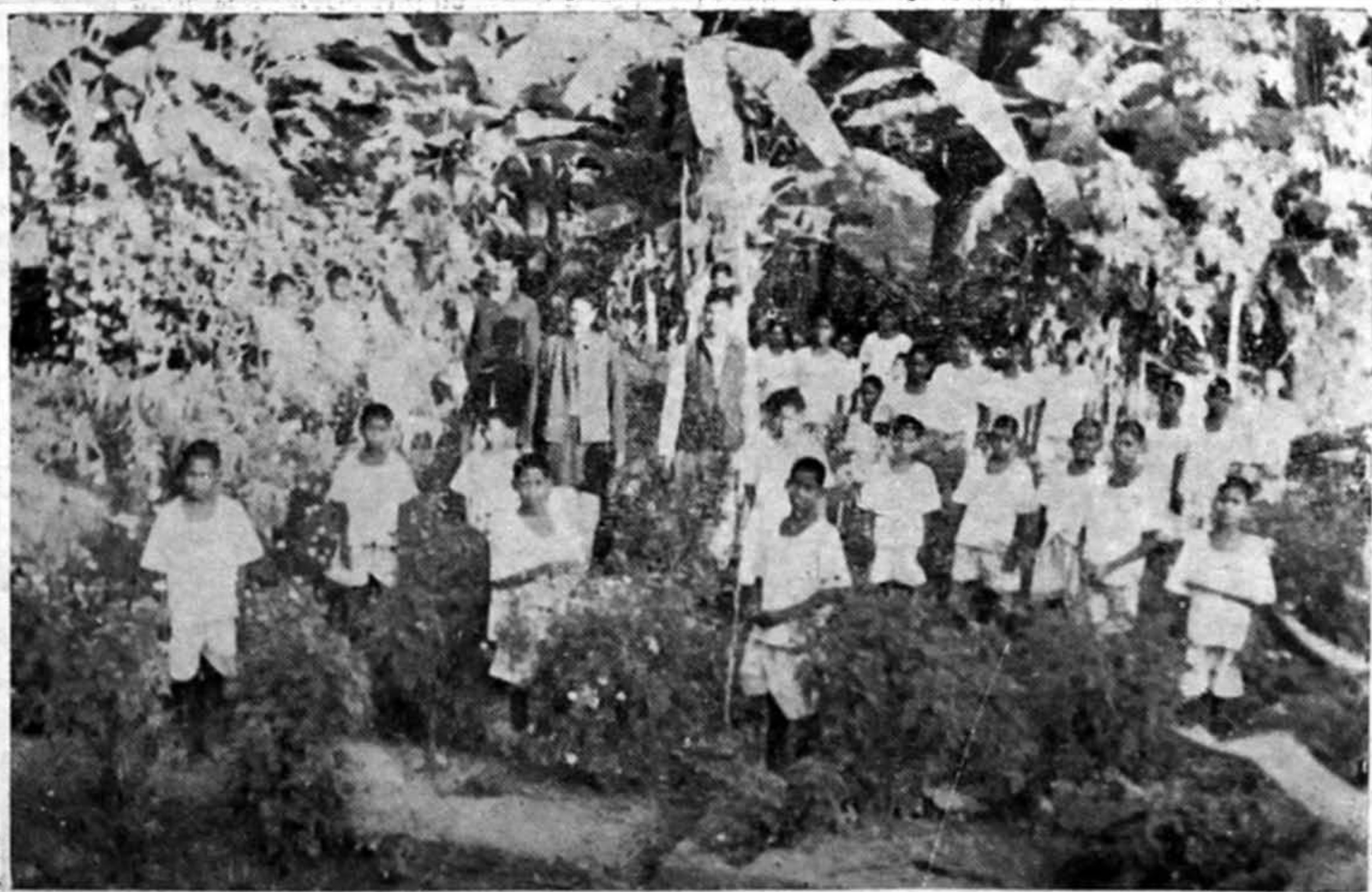
Ashram School boys at Khantara, working in the Ashram garden.