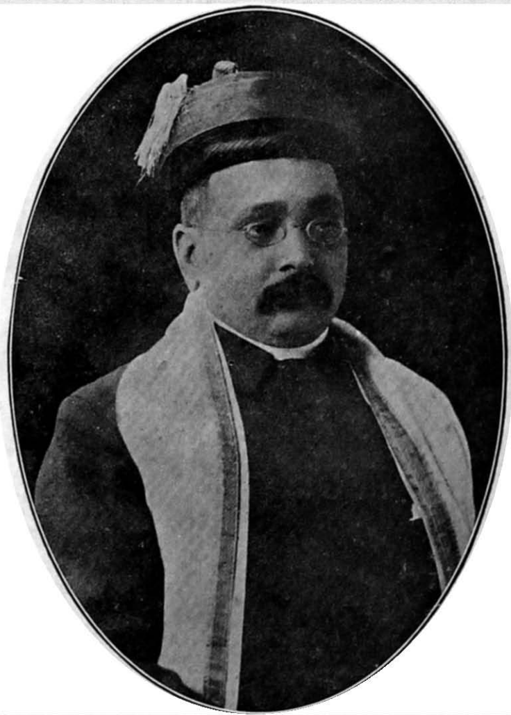
FOUNDER The Servants of India Society