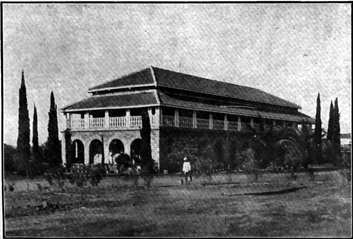
View of the Central Library of the Society, Poona.