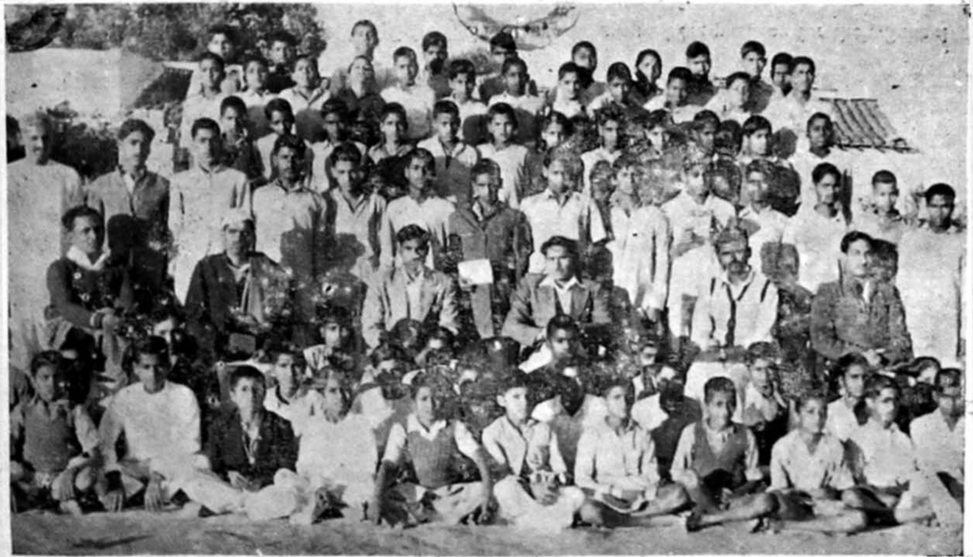
Students and Staff of the Junior High School, Pachokhara.