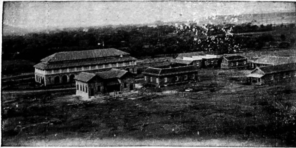
Bird's eye view of the Poona Home and grounds.