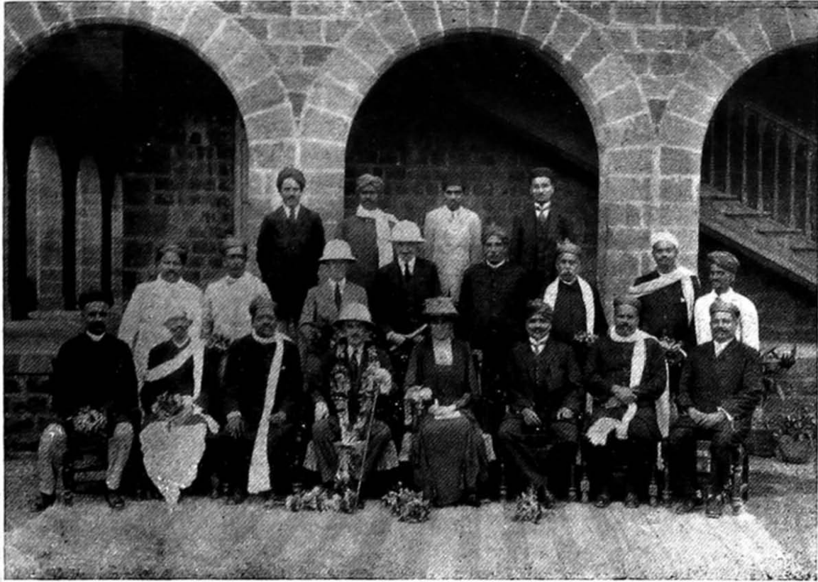
Their Excellencies' ( Sir George & Lady Lloyd ) visit to the Servants of India Society, in 1918.