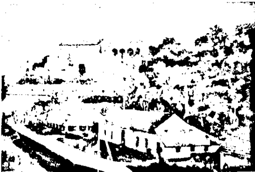
Court Hill Higher Elementary School, Mangalore.