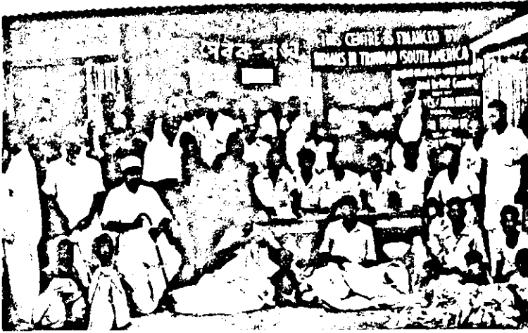
Cloth Distribution at a Centre in East Bengal.