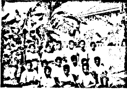
Junior Boys of the Boarding Home.