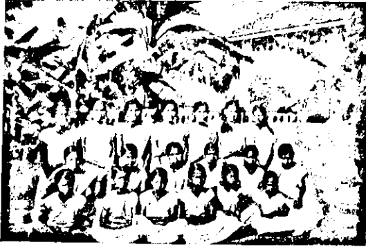
Inmates of the Girls' Hostel.