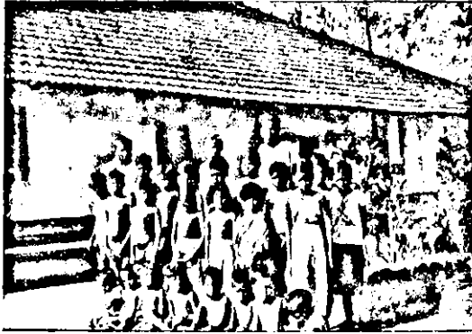
The Koraga Hostel, Puttur