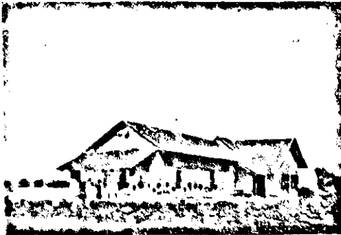
Sadhikashram; Dr. Karnad's Boys' Hostel.