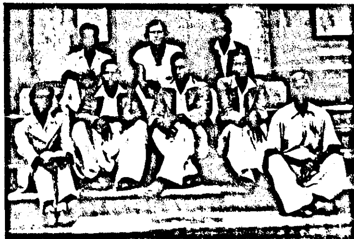
Medical Personnel, Baraikhali Centre.