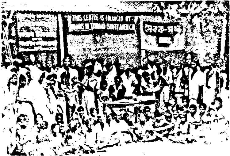
Children's Milk Canteen, Mehar, Dist. Tippera.