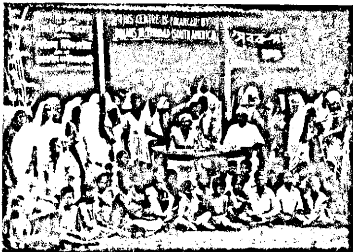
Medical Relief Centre, Baraikhali, Dist. Dacca.