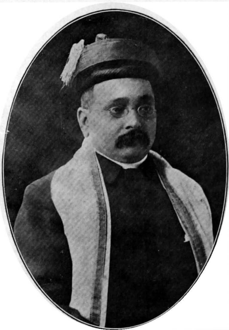
Founder Servants of India Society