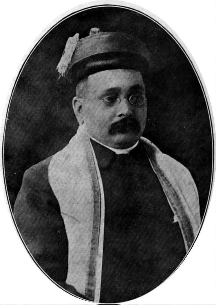
Founder Servants of India Society