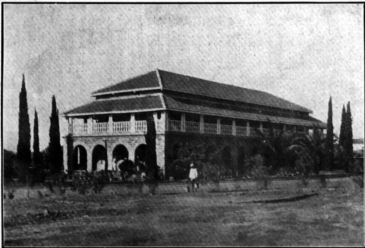
View of the Central Library of the Society. Poona.