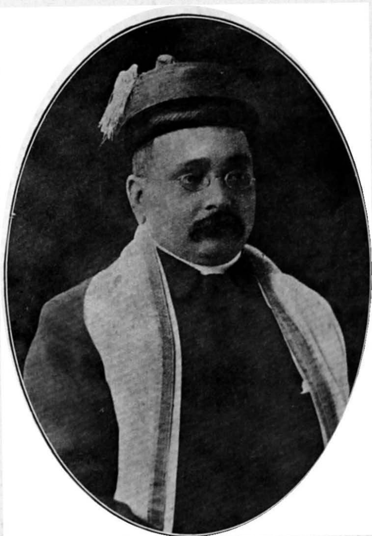
Founder ( Servants of India Society. )