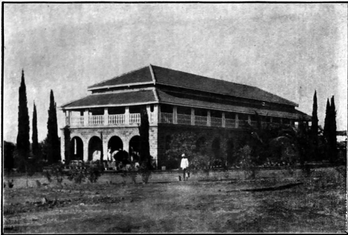
View of the Central Library of the Society, Poona.