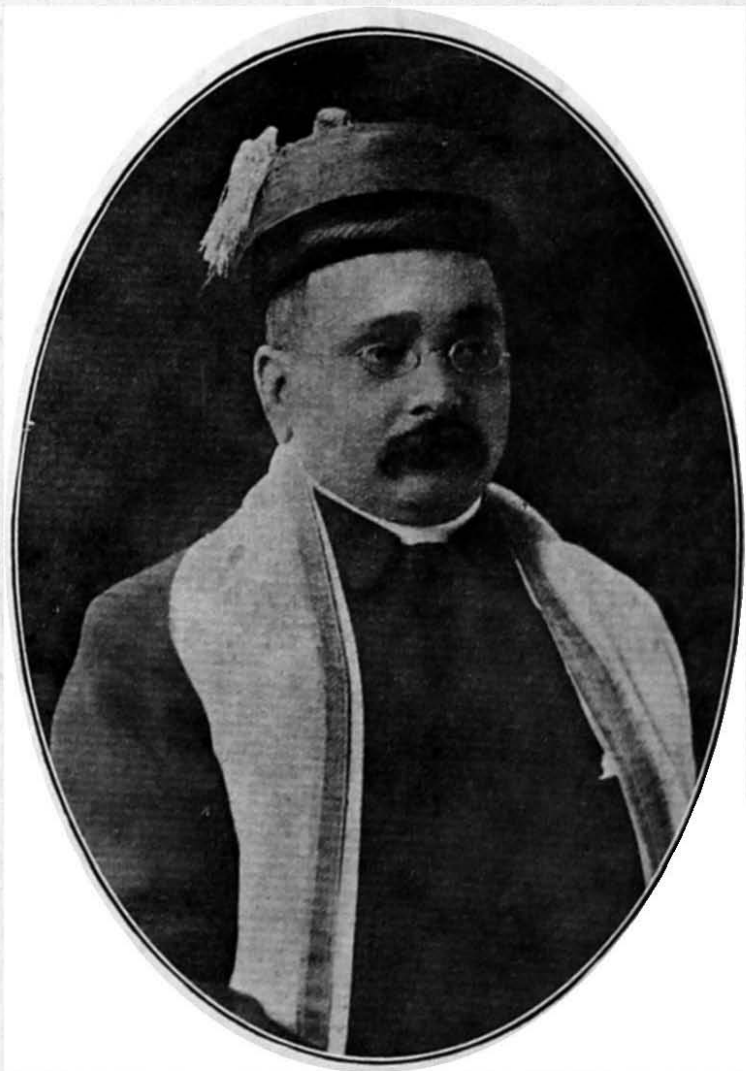
Founder ( Servants of India Society. )