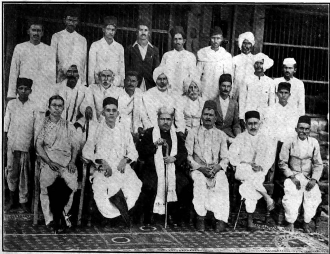
Rural Welfare Centre at Bhambora.