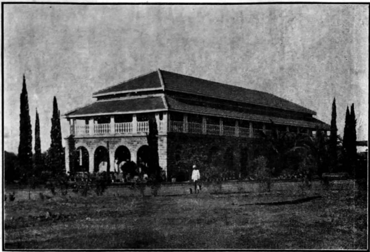
Servants of India Society's Home, Poona.