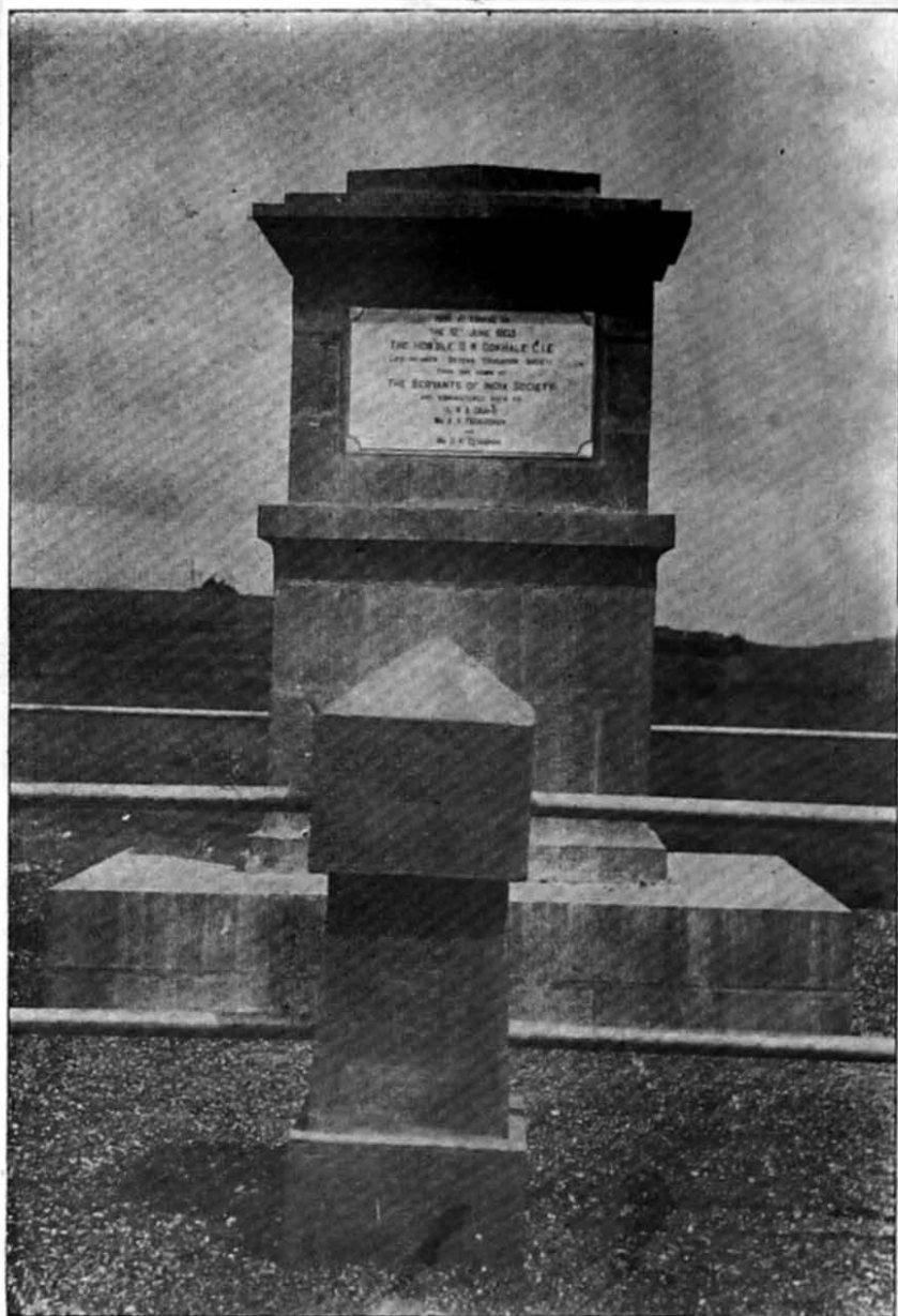
Tablet Marking the Spot where the Society was founded.