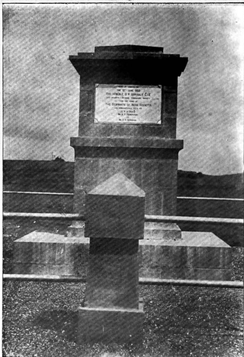
Tablet Marking the Spot where the Society was founded.