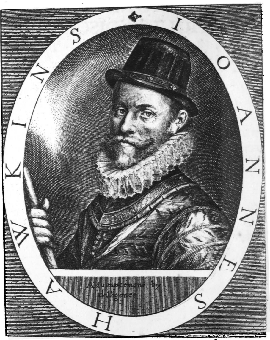
Qui vicit totions in Fructis classibus bostes Gle Vagis HAVKINS vitam relliquit in Vadis