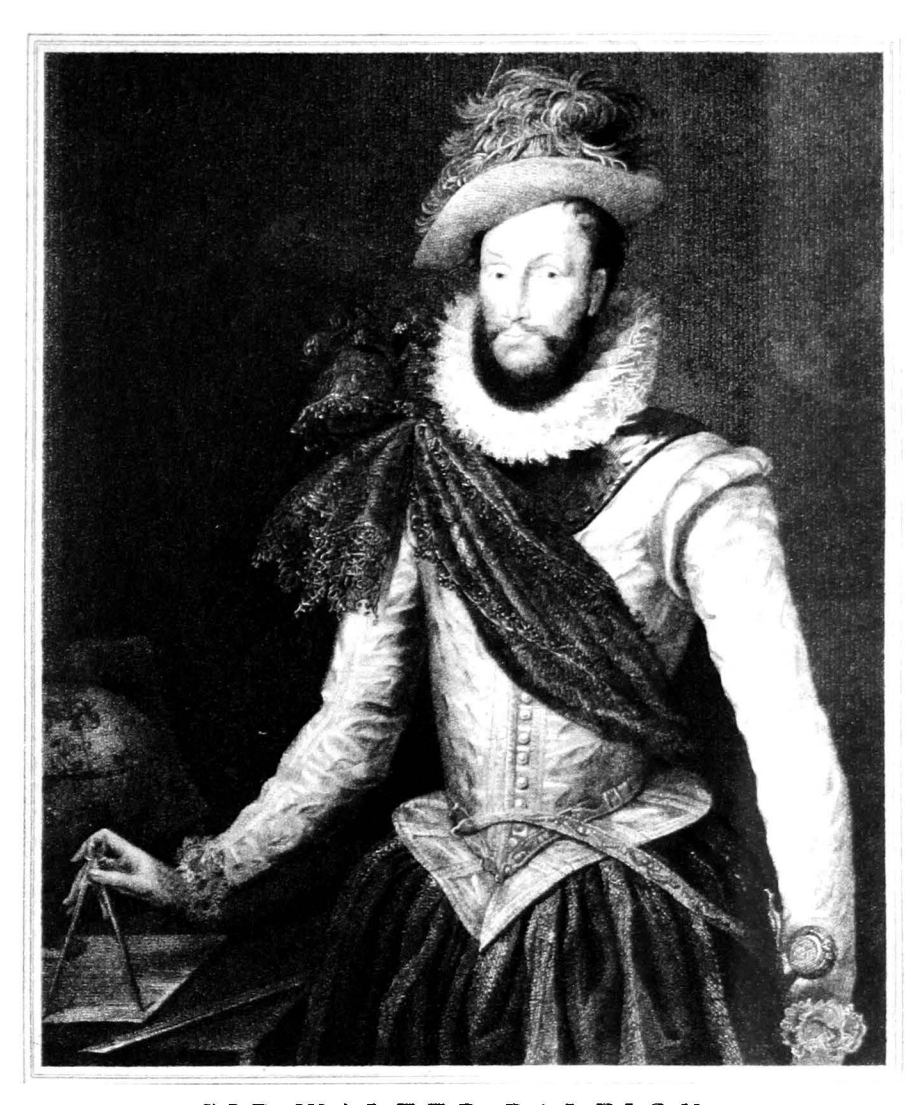
SIR WALTER RALEIGH

From "Portraits of Illustrions Personages of Great Britain," by Edmund Lodge (1821)