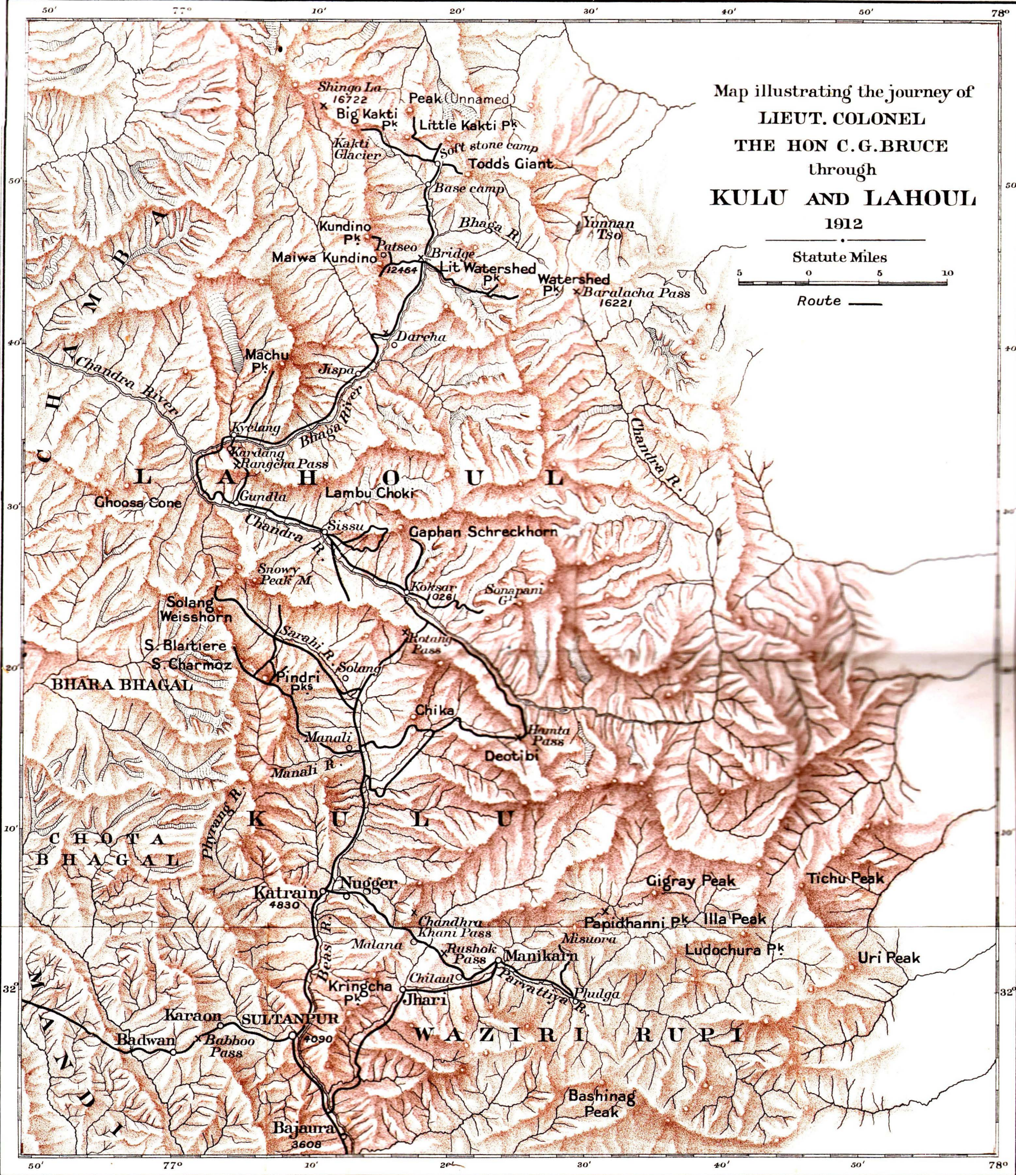
Map illustrating the journey of LIEUT. COLONEL THE HON C.G. BRUCE through KULU AND LAHOUL 1912