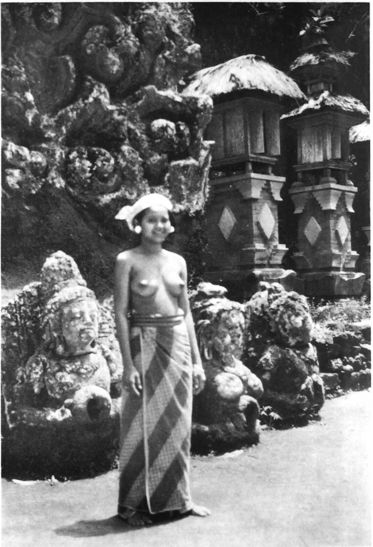
THE BELLE OF BALI