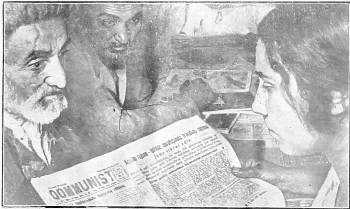
Komsomolka (Young Communist) reading a Turkish newspaper in Latin script to peasants at a kolkhoz (collective farm) in Azerbaijan Republic,