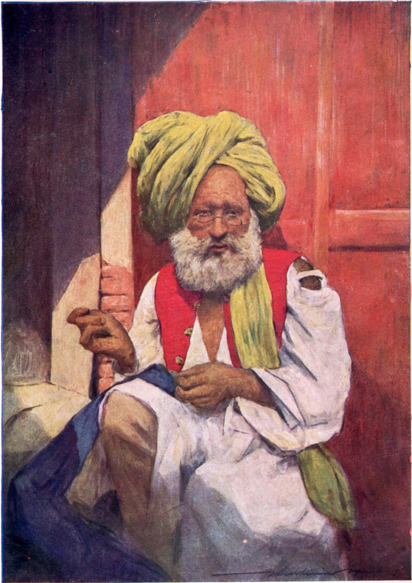
A TAILOR AT WORK (page 1).