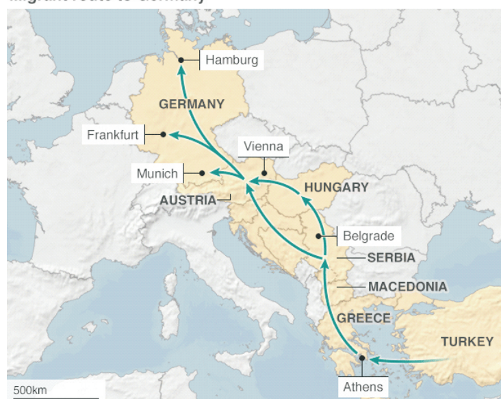
Migrant route to Germany