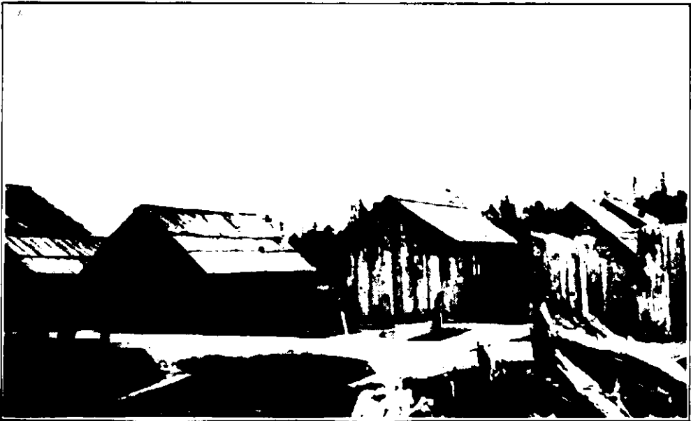
THE HOUSES BUILT BY MIGRANTS IN THE CLAM INDUSTRY ARE MERE SHACKS OFTEN BUILT CLOSE TOGETHER IN LITTLE SETTLEMENTS AT THE WATER'S EDGE