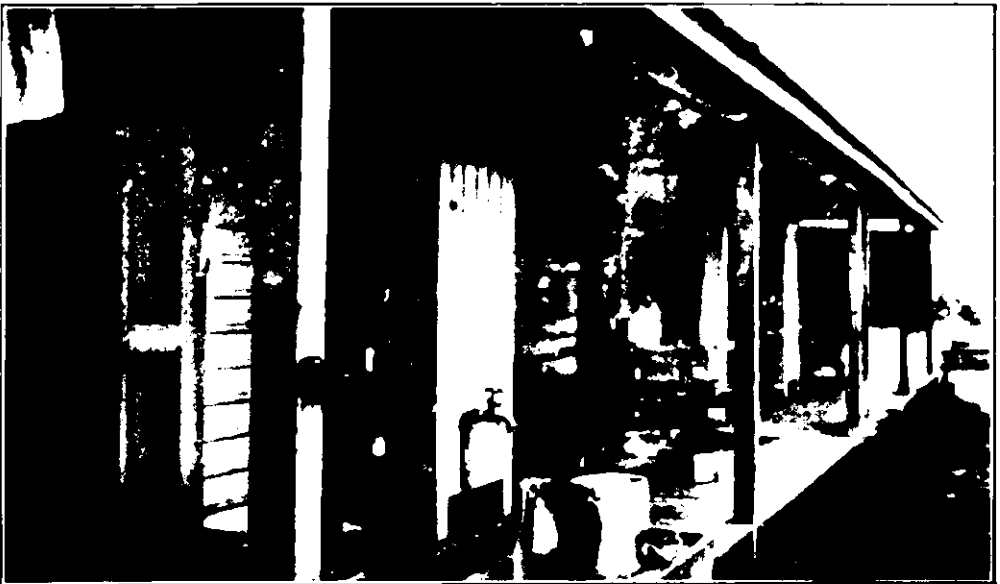
MANY MIGRANTS LIVED IN THE ROW TYPE OF QUARTERS—ONE ROOM FOR A FAMILY AND A STOVE IN COMMON