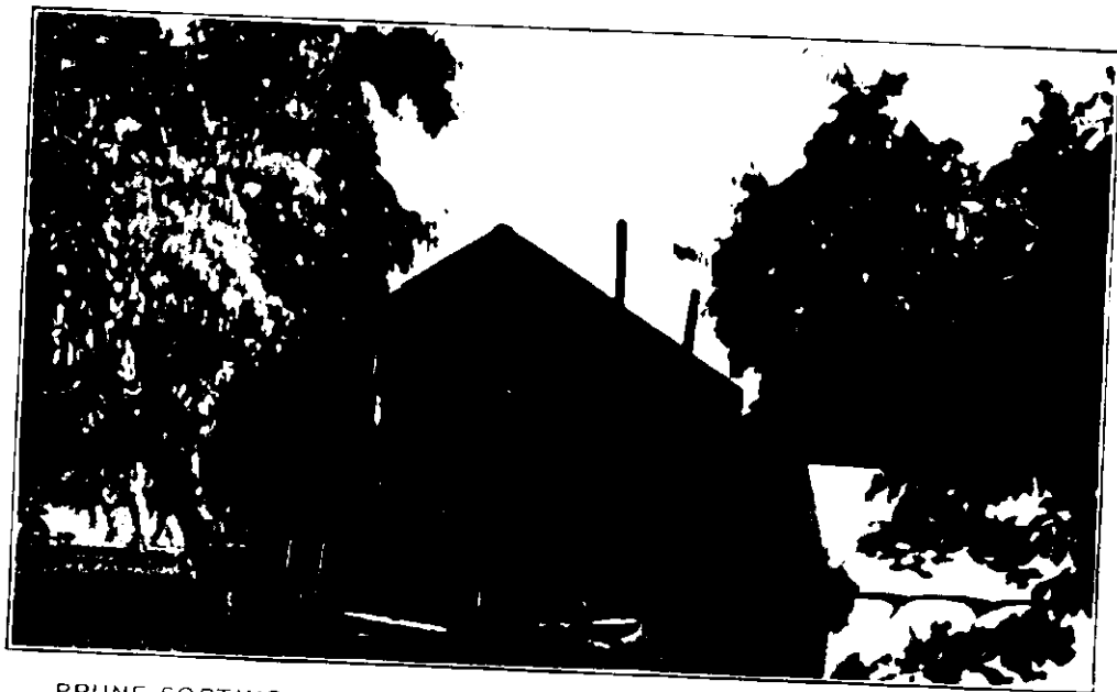
PRUNE SORTING IS DONE IN THE DRIER, A LARGE FRAME STRUCTURE ON THE EDGE OF THE ORCHARD