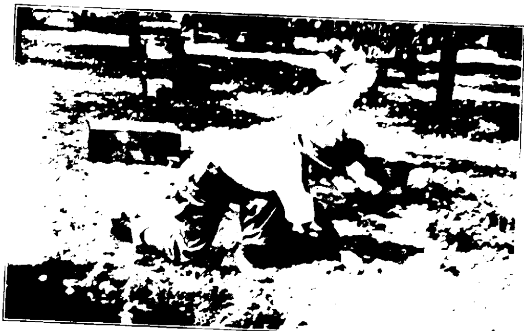
IN PRUNE PICKING THE WORK IS POSITION