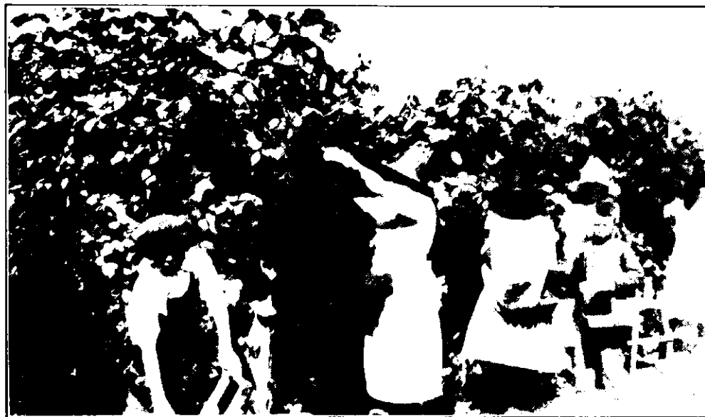
RASPBERRIES ARE USUALLY AT A COMFORTABLE HEIGHT FOR PICKING