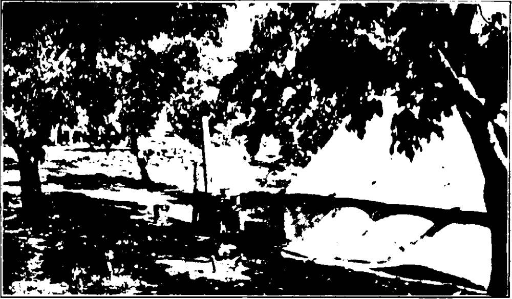
ON SOME RANCHES TENTS WERE THE ACCEPTED TYPE OF HOUSING