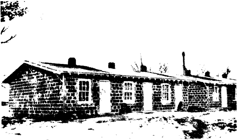
New housing for families of beet laborers constructed by a sugar company.