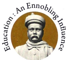
Gopal Krishna Gokhale

Agro-Economic Research Centre Gokhale Institute of Politics and Economics (Deemed to be University) Pune-411004