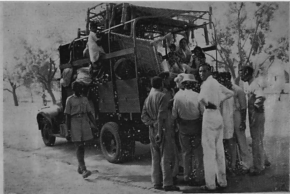
Refugees are being forcibly removed to be dumped, they do not know where.

The displaced persons in Delhi, now threatened with eviction, have sunk in the building of shelters for themselves a sum estimated at not less than Rupees one crore. The Government have wasted a crore of taxpayers' money. Are they now going to inflict a loss of another crore of rupees on the unfortunate refugees who have already lost so heavily?