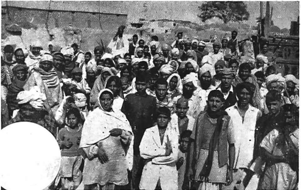
Damdama displaced destitutes who are the latest victims of the Delhi Demolition Squad.