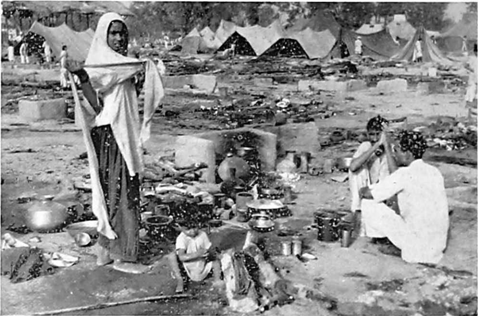
Ruined homes, if refugees' improvised shelters can be called homes, are ruined once again in Delhi.

But the Hindus and the Sikhs of the North-West are a hard-dying race. They have survived hundreds of foreign invasions of India from the west and they were the last to go down before the invasion of the British from the east. The sacrifices in blood and tears made by them in the Martial Law days and thereafter are unequalled in the history of the freedom struggle.