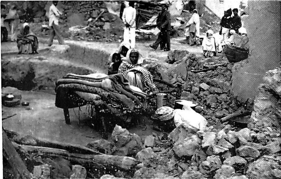
Living in the open after demolition of huts. One refugee girl died of exposure and several others fell ill and, this in RAM RAJAYA.

After all what is the fault of the lacs of displaced persons who made Delhi their home at the time when Government machinery utterly failed to rehabilitate them? In September, 1947 the machinery of both the Central and the local administration had almost crumbled down in this direction. The refugees through their own unaided efforts were able to erect a sort of roofed accommodation over their heads and set up their business here and there. No neutral observer could help admiring the grit and self-reliance of these brave people.