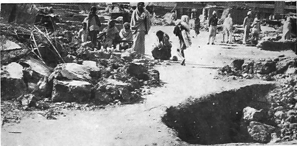
Desolation in Delhi—Not an earthquake but a man-made quake has produced these ruins of the homes and hopes of these Pursharthies.

But the displaced persons living in Delhi now know it for certain that gods that be have made up their mind to make them homeless and shelterless once again and the campaign has been launched in the depth of Winter to make the refugees realise fully not only the vigour of Law but also the rigour of Winter. The law is not yet passed but the enforcement of it in anticipation has already started. Contemptuously indifferent to the demand of reason and humanity, the Delhi Demolition Squad marches on. Hundreds of smashed houses, stalls and shops on Faiz Bazar, Queen's Road, Karol Bagh, Moti Nagar, Subzi Mandi etc. mark its triumphs. The "Ugly" spots in Delhi mar its beauty according to the Delhi Administration, but in reality are an eyesore to those in authority, because these depict a true picture of what sub-human existence the refugees are leading in the Capital of India. After their removal, will not the foreign visitors and Embassy staffs get the impression that the Government of India has succeeded in fully solving the refugee problem? Out of sight out of mind. The refugees are already out of the mind of the new rulers.