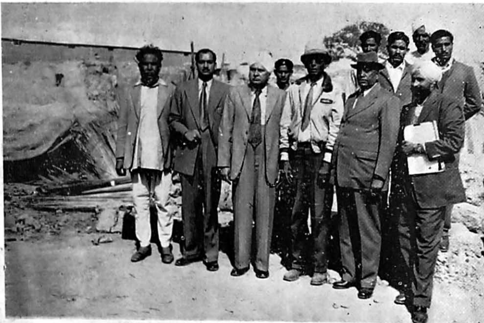
Refugees ruined at the hands of Authority are given succour by the refugees' own relief societies.

commission which have ruined the prosperous people of four Provinces. Would you as a member of Parliament or as a Minister, entrusted with executive power over the lives of millions, be a party to doing things which the Father of the Nation would never have tolerated? Did not Mahatma Gandhi say: "As I imagine the Lahore resolution in practice, I see nothing but ruin for the whole of India"? How the words are proving prophetic! "To secure justice for the Hindus and Sikhs was the function of the Government" according to Mahatma Ji. But Mahatma Ji is no more and in a Secular State, the very talk of justice for the Hindus and the Sikhs is taboo. Pandit Jawahar Lal Nehru is the Government of India at present. The refugees can only hope and pray that their appeals for justice and fair-play will find an echo in his heart.