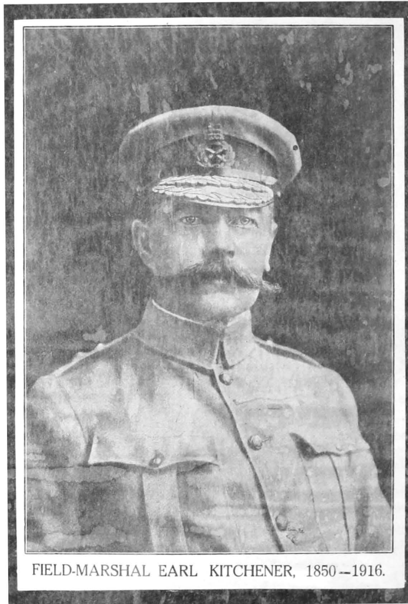
FIELD-MARSHAL EARL KITCHENER, 1850--1916.

The tragic and most pathetic death of Lord Kitchener has no parallel in modern British history. One of the greatest and most necessary personalities in the Empire—no other man indeed could the Empire so ill afford to lose—he has been brutally swept into eternity when almost at the zenith of the mighty task he set out to do on the war's outbreak. That he, of all men, should not have been spared to see the end, and to have shared in the wonderful metamorphoses the end will bring, is surely the very essence of tragedy—a monstrous joke of a callous Providence, a senseless, inhuman trick of Fate. Or, perhaps, great as it is, his removal is but a small thing in the illimitable and inscrutable scheme of which the war is part.