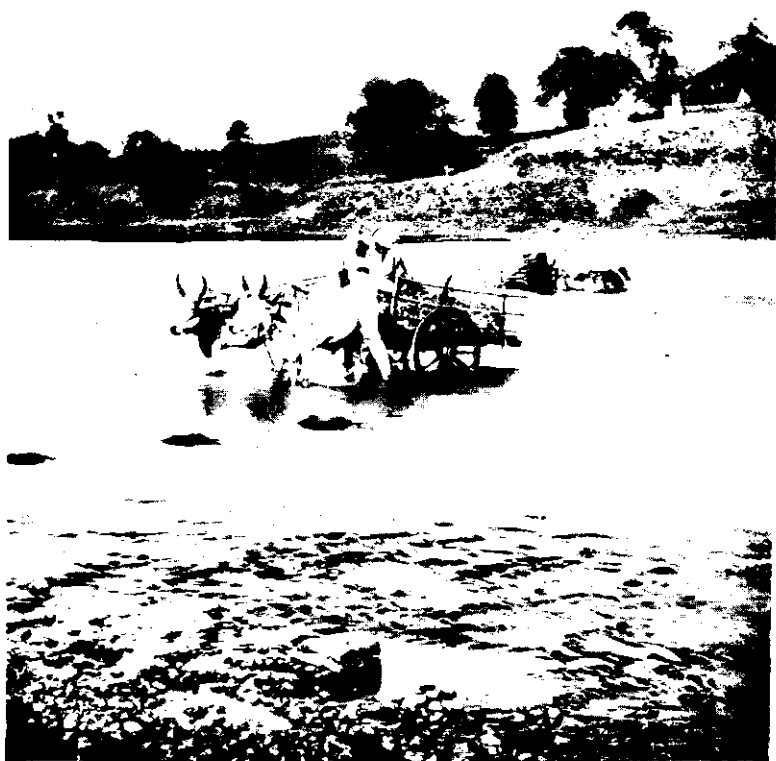
FORDING A RIVER DURING THE RAINS IN THE UNITED PROVINCES