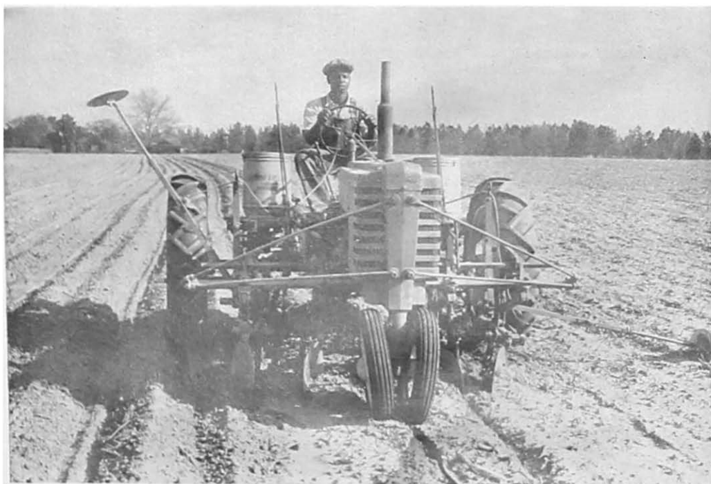
PROPER APPLICATION OF HIGH ANALYSES FERTILIZERS AND GOOD SEED IMPORTANT FOR MAXIMUM YIELDS

* Clemson Agric. College Extension Circular 283, 1946