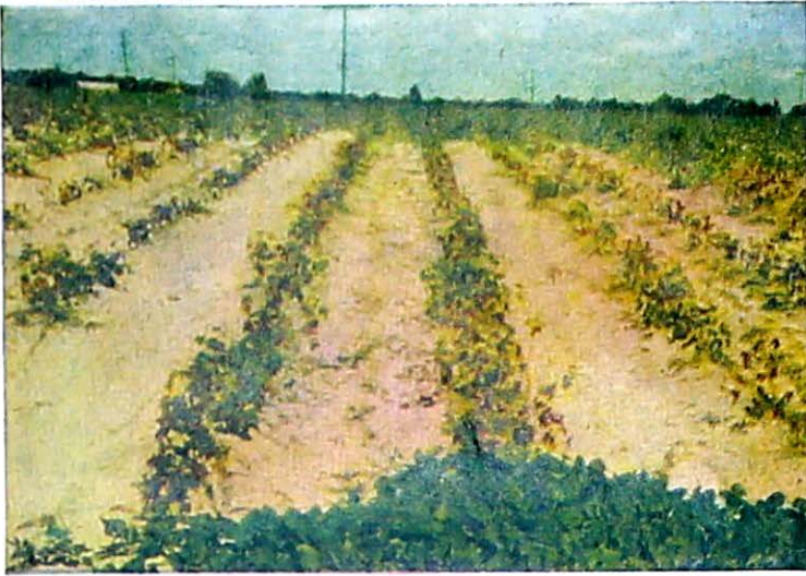
A field of cotton in an advanced stage of magnesium deficiency.

The symptoms of the disease appear first on the lower leaves which turn dull red with pale green mid-rib and veins.