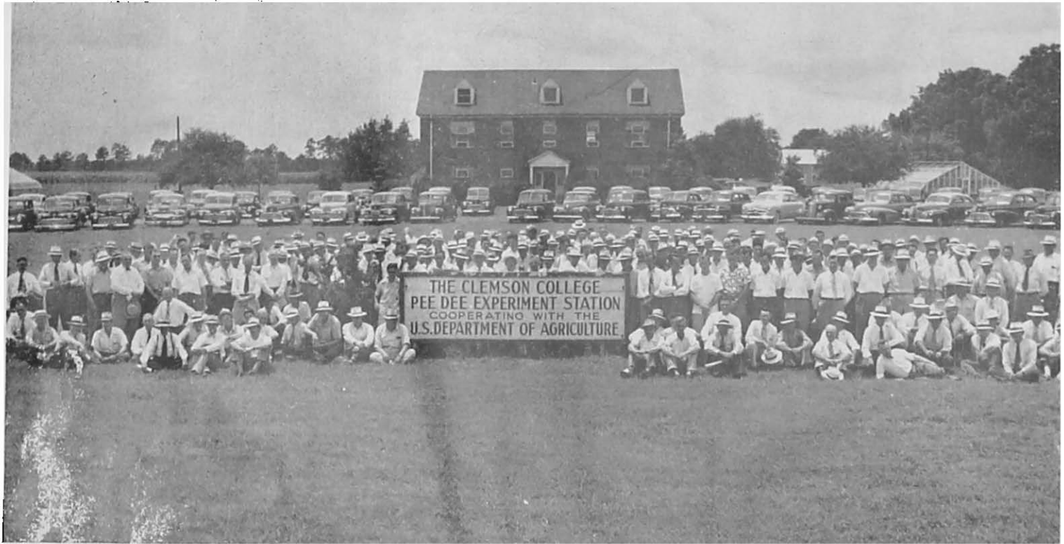
FERTILIZER MANUFACTURERS, DEALERS, SALESMEN AND OTHERS ATTENDING TOUR AT PEE DEE EXPERIMENT STATION, FLORENCE, S. C.