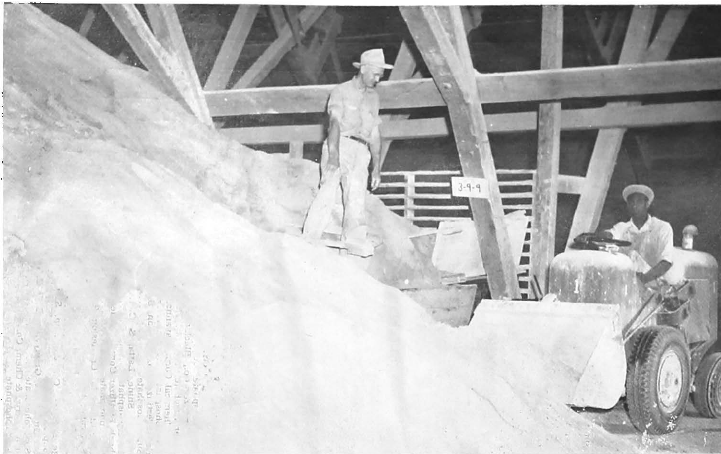
POWER MACHINERY MOVING MIXED FERTILIZER (3-9-9) FROM CURING PILE TO BAGGING MACHINE