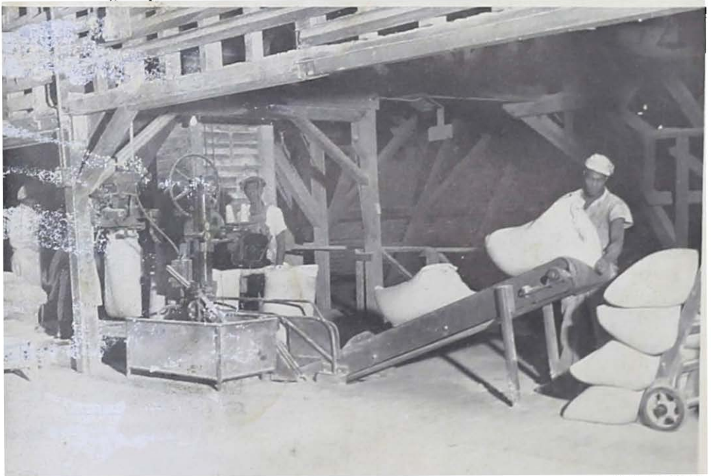
MODERN EQUIPMENT MAKES FOR EFFICIENT PLANT OPERATION (Bagging machine, sewing machine, bag conveyor at work)