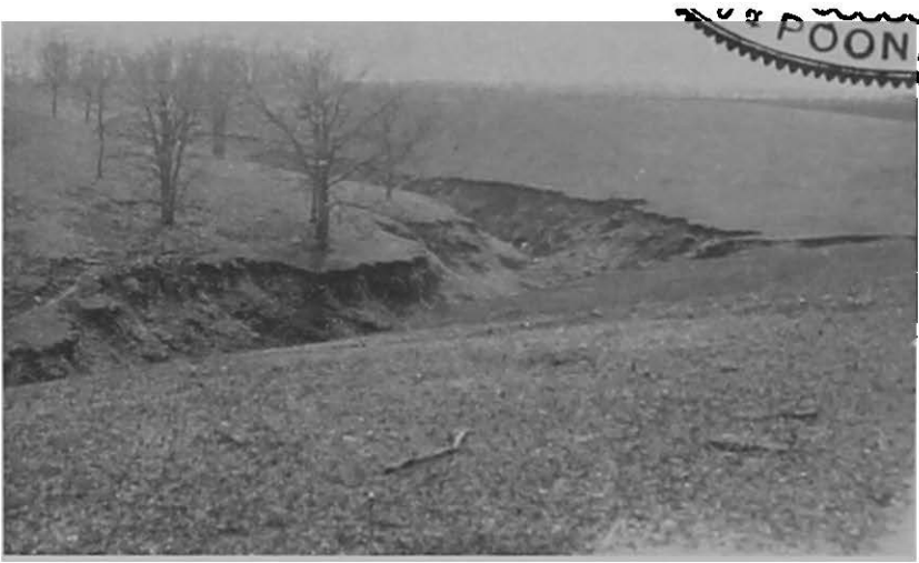
Fig. 1. This gully formed after the slopes were cleared of timber. Excessive grazing has caused further washing. Notice how the gully is widening.

its downward plunge. It either runs down the twigs, branches and trunks or slowly drops off.