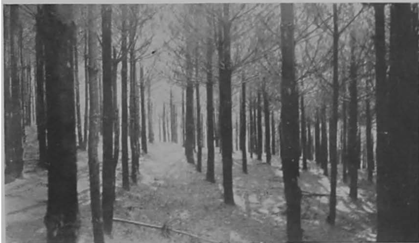
Fig. 5. White Pine planted on steep land to stop excessive sheet erosion. These trees are 13 years old. Tama County.

Natural Seeding and Sprouting. Natural regeneration of trees can be accomplished wherever mature, seed-producing trees stand on or adjacent to the area, and by sprouts from stumps of recently cut trees. In either case, natural regeneration from seed-trees or from stumps, the area must be fully protected from livestock to prevent the young trees from death or injury by browsing or trampling.