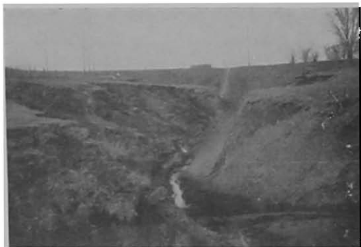
Fig. 2. This large, raw gully in Monroe County was widening at the expense of adjacent fields.

The United States Department of Agriculture defines submarginal land as "land so poorly adapted to farming, or so seriously deteriorated that nothing is in store for the inhabitants but extreme poverty and wretchedness." In Iowa extended areas of sub-