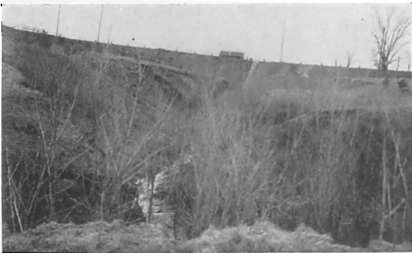
Fig. 3. The same gully as shown in fig. 2, 4 years later. Willows are in the moist bottom, locust occupy the steep dry slopes, and pines have been planted back from the lip of the gully.

Cold, Moist Storage. Some seeds must be kept in cold, moisture storage over winter. The following method is sometimes called stratification. Moist sand is placed in a box to a depth of 1 inch and covered with a layer of seed 1 inch thick, and another 1 inch layer of sand followed by another