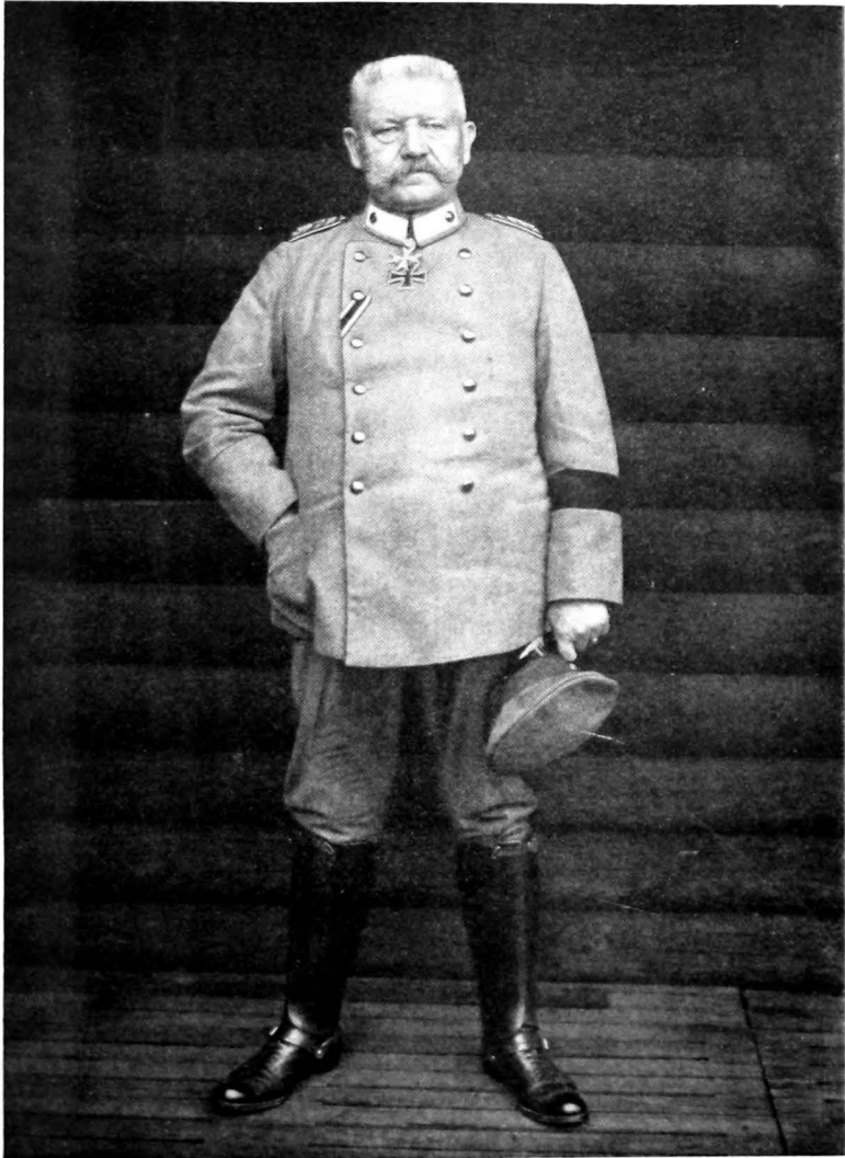
FIELD-MARSHAL VON HINDENBURG, THE NATIONALISTIC CANDIDATE FOR THE GERMAN PRESIDENTIAL ELECTION