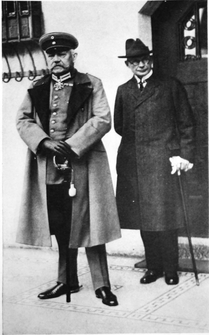
GENERAL VON HINDENBURG, CANDIDATE FOR THE REICHSBLOCK, REVIEWS A DEMONSTRATION OF PATRIOTIC ASSOCIATIONS AT HIS VILLA IN HANOVER