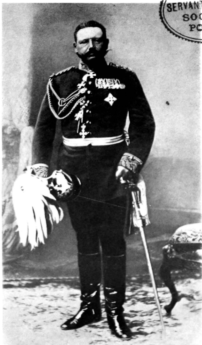
PRESIDENT VON HINDENBURG AS MAJOR GENERAL AND CHIEF OF THE GENERAL STAFF OF THE EIGHTH ARMY CORPS IN 1897 AT COBLENTZ