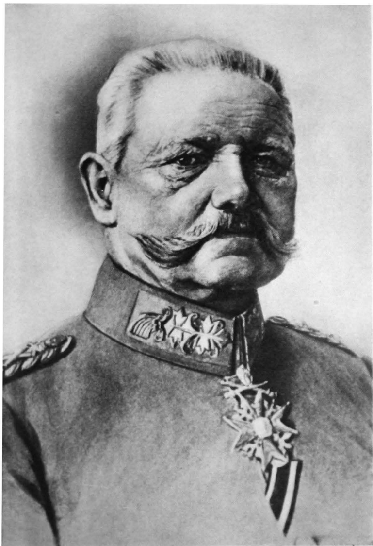
FIELD-MARSHAL VON HINDENBURG AT THE TIME OF HIS NOMINATION FOR THE PRESIDENCY