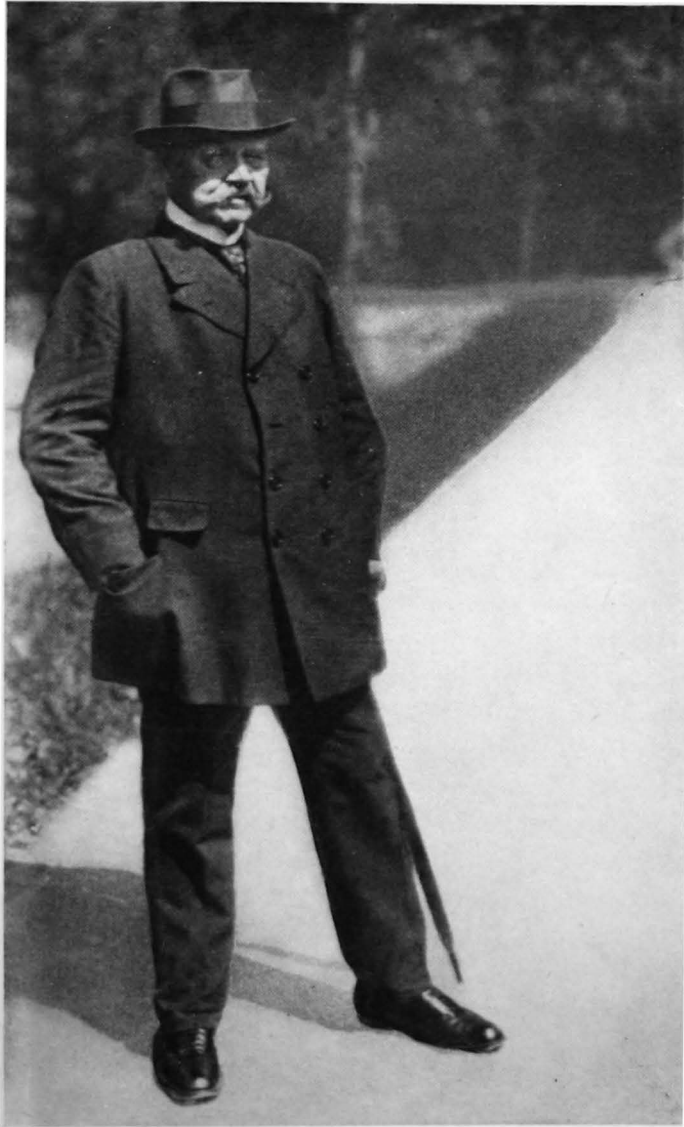
PRESIDENT VON HINDENBURG RETURNING HOME FROM A WALK IN HANOVER AT THE TIME OF HIS ELECTION