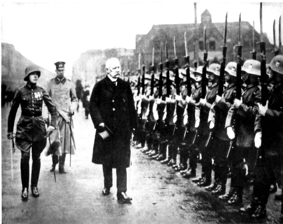
PRESIDENT VON HINDENBURG INSPECTING THE GUARD OF HONOUR ON HIS ARRIVAL AT LEIPZIG FAIR