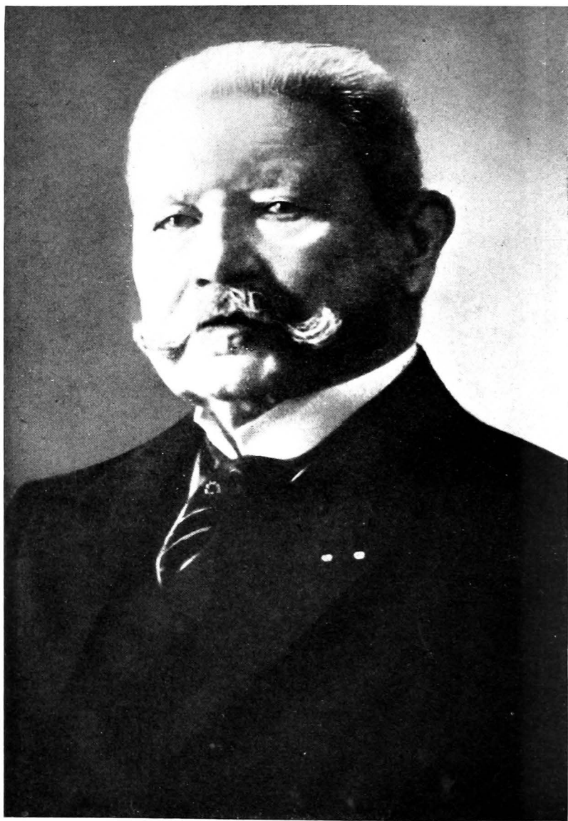
PRESIDENT VON HINDENBURG