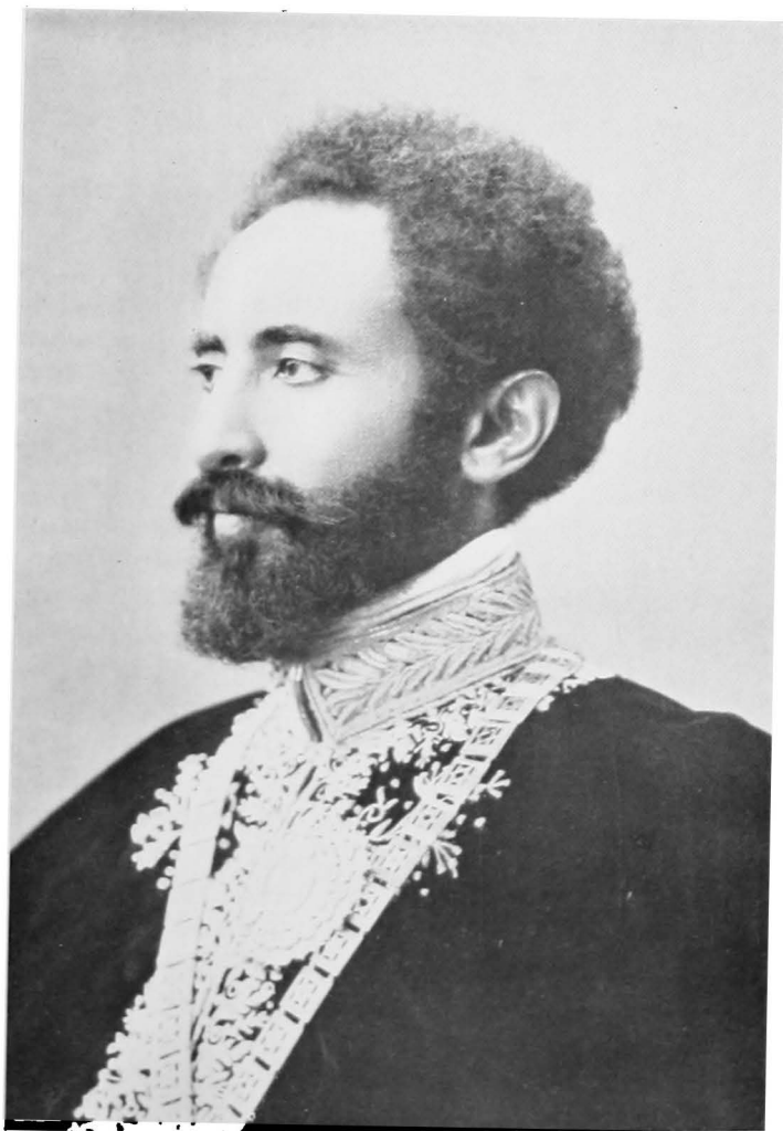
THE EMPEROR HAILÉ SELASSIÉ