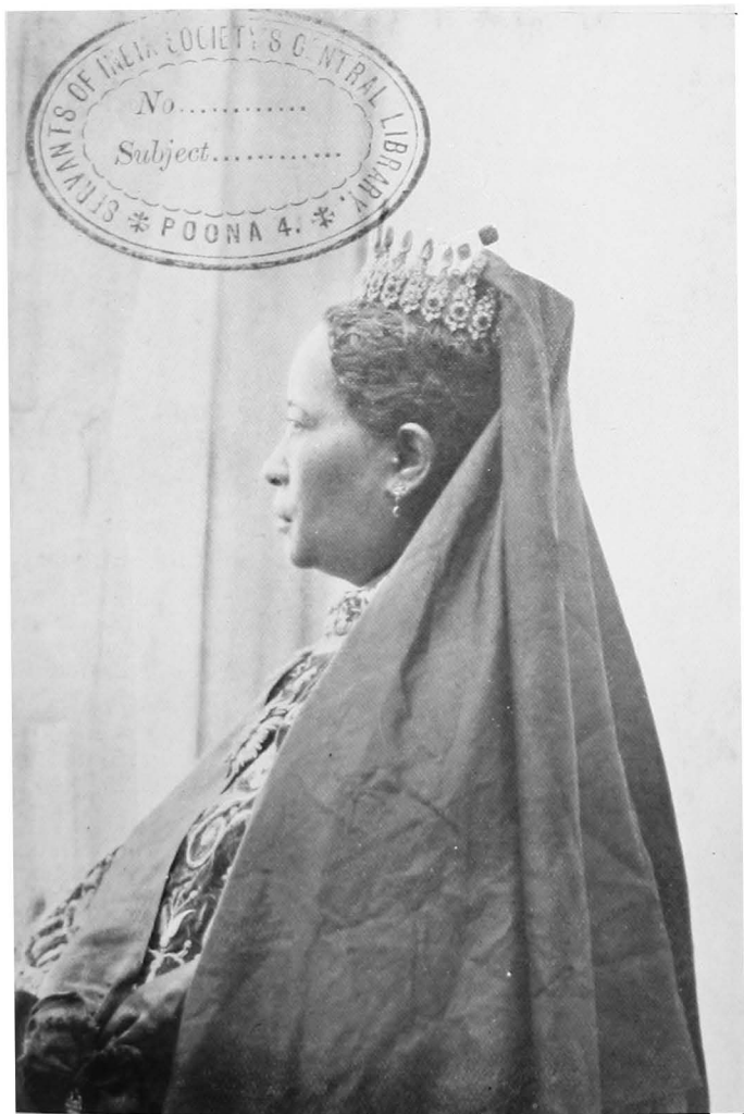
THE EMPRESS ZAUDITU