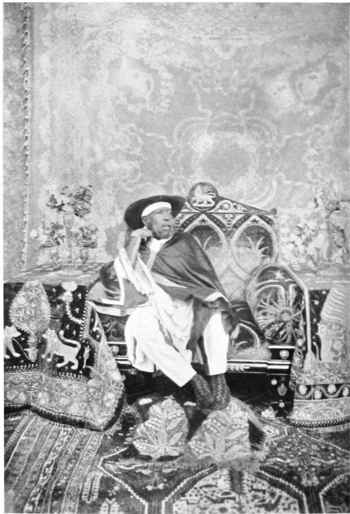
THE EMPEROR MENELIK