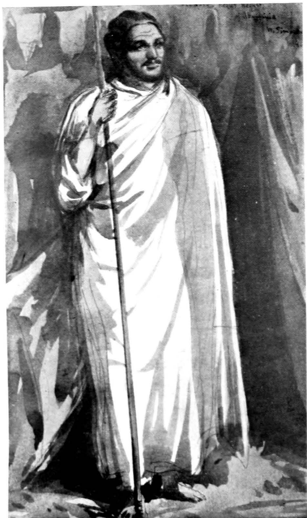
THE EMPEROR THEODORE