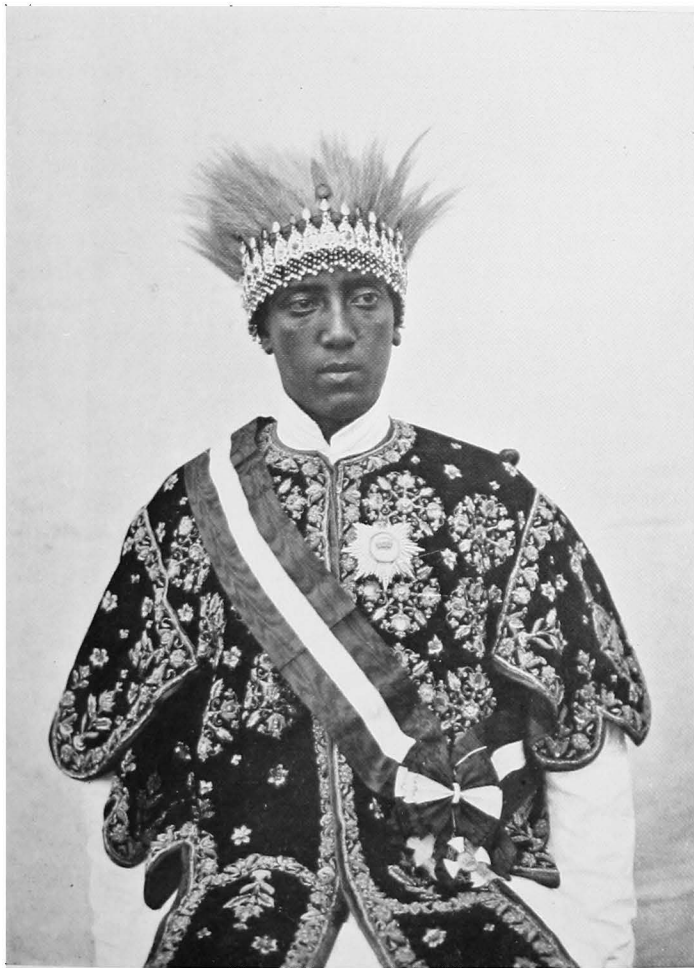
THE EMPEROR LEDJ JASU