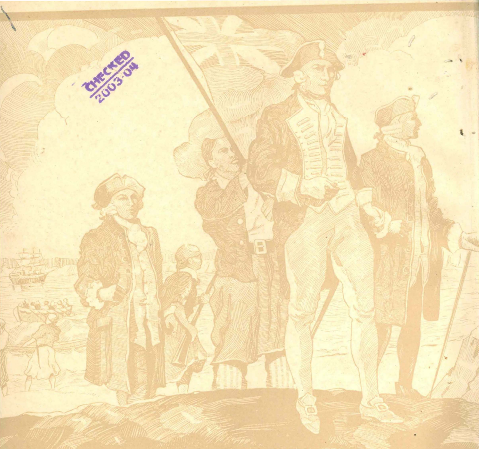
THE LANDING OF CAPTAIN COOK, BOTANY BAY, 1770