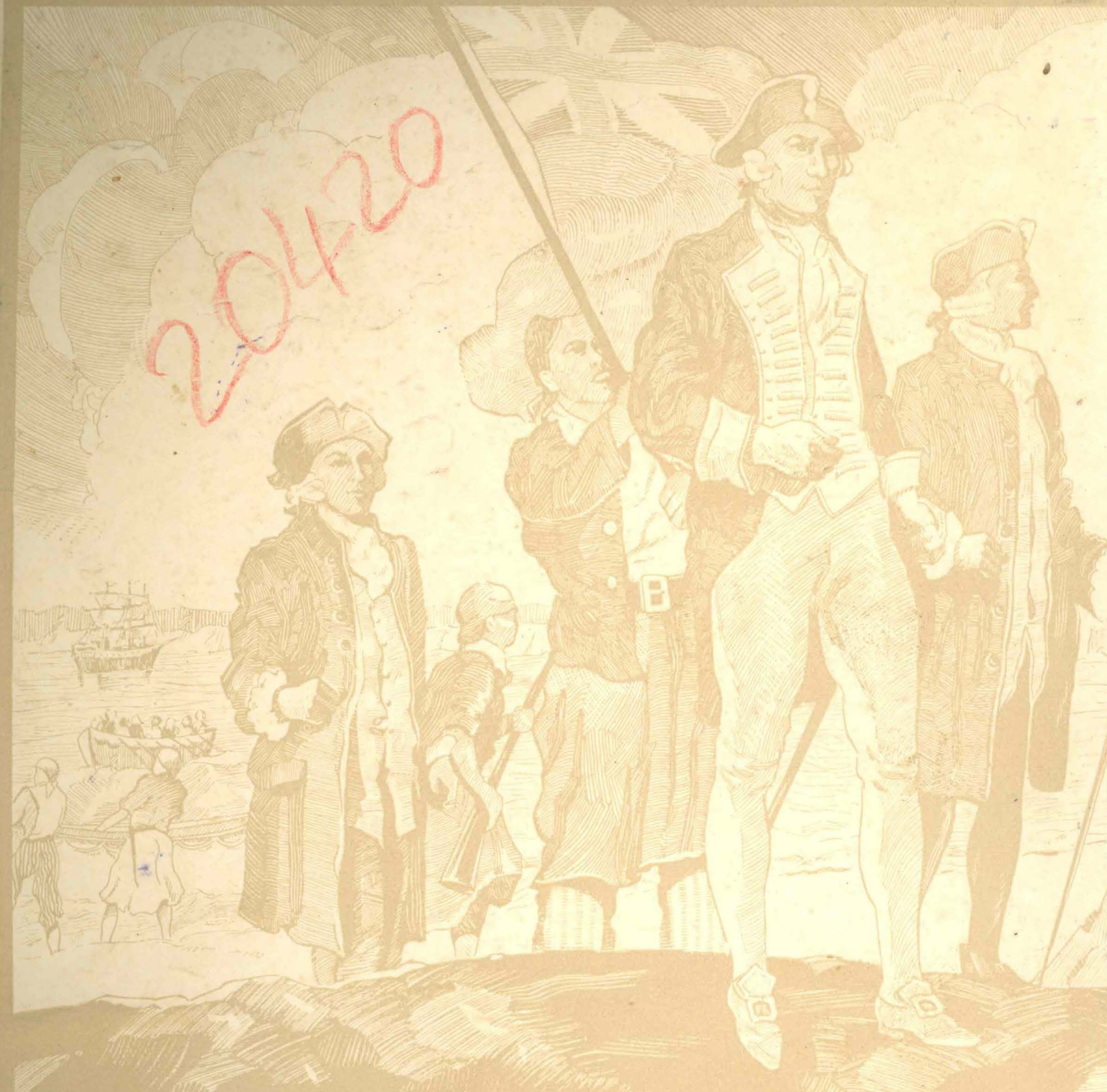
THE LANDING OF CAPTAIN COOK, BOTANY BAY, 1770