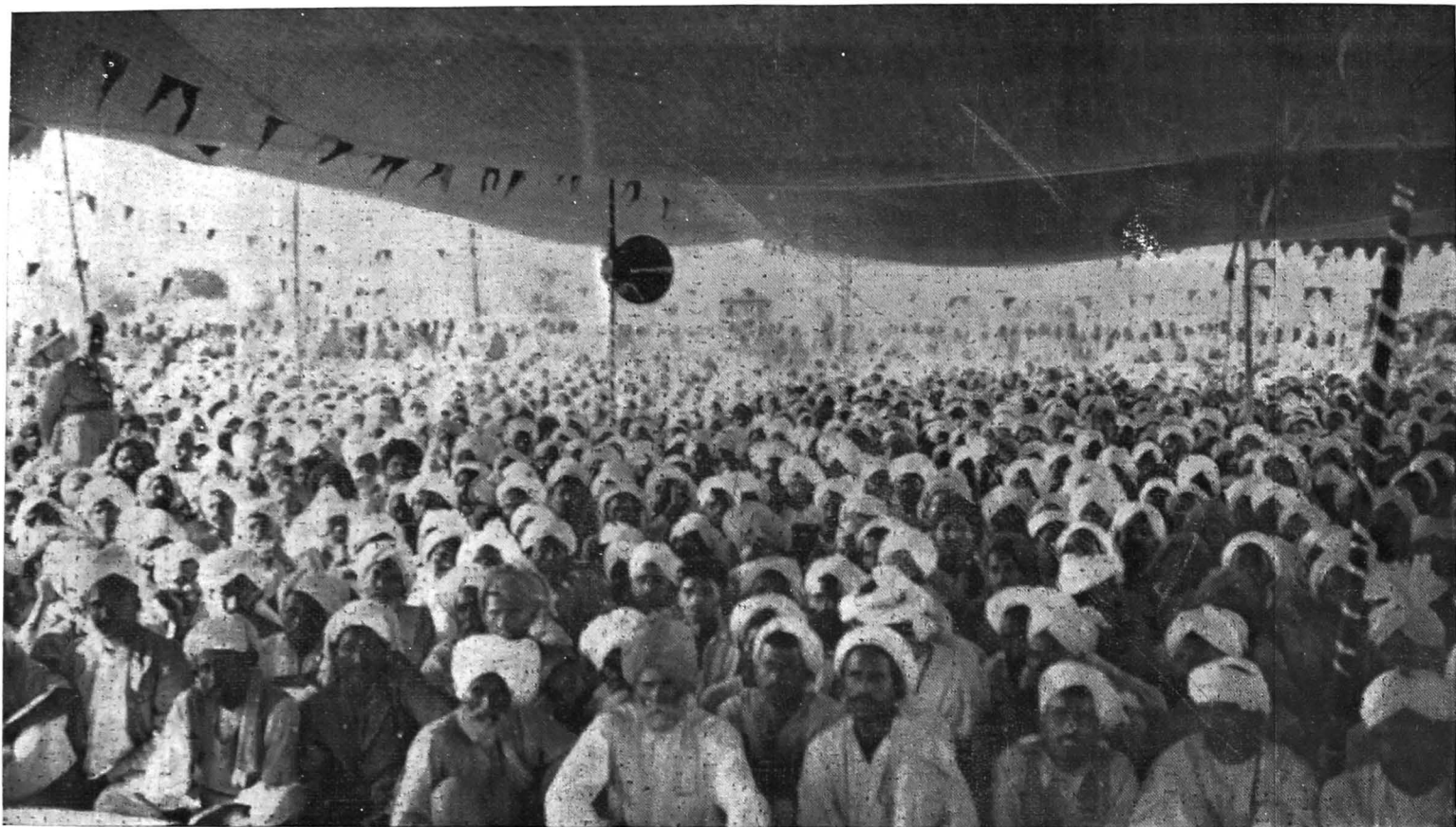
The announcement about concessions to sub-tenants was well received—See page 48.