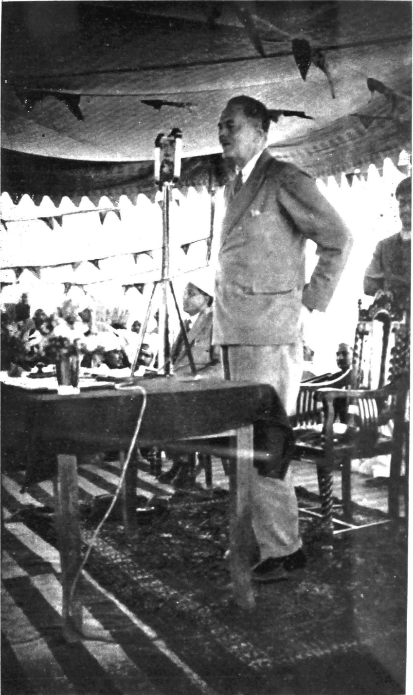
The Financial Commissioner (Development) announced concessions to sub-tenants in Nili Bar—See page 18.