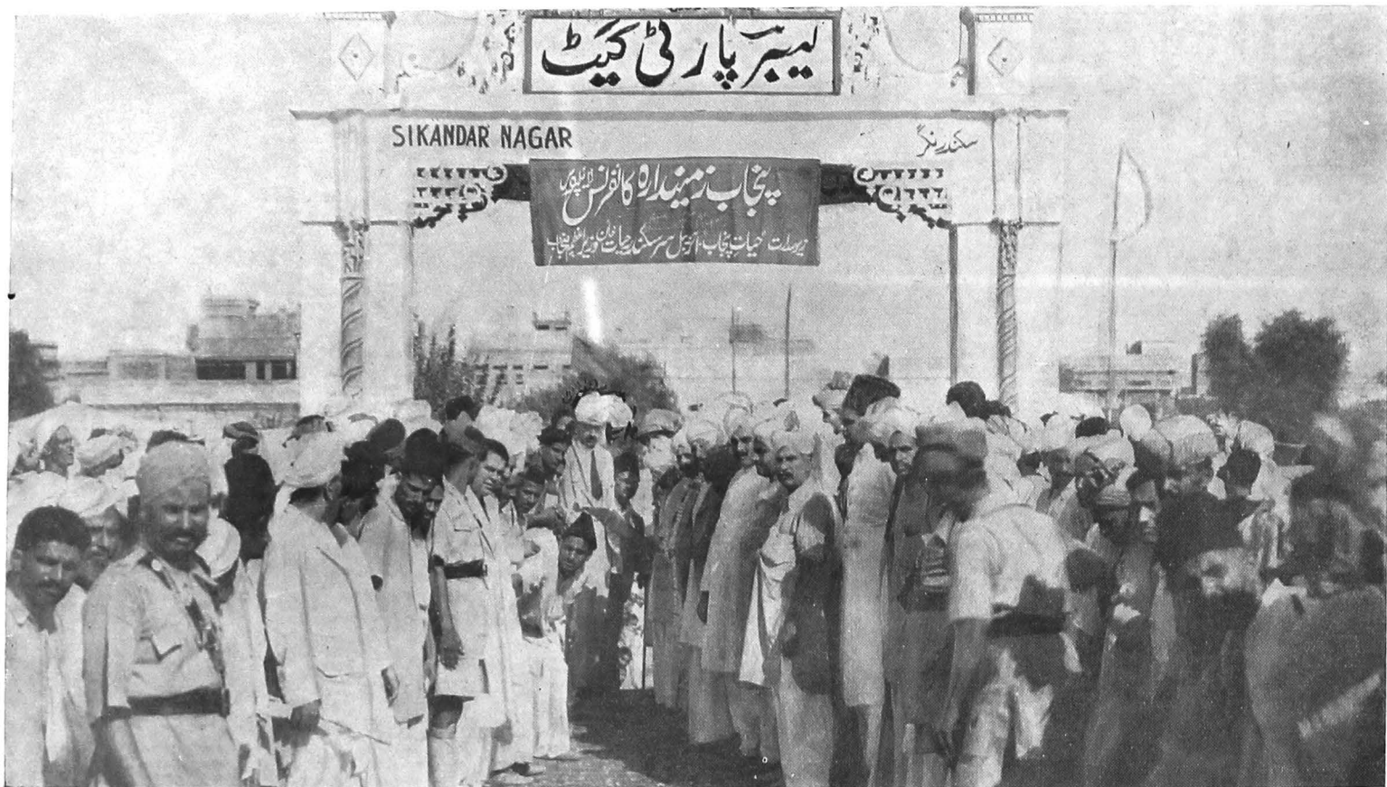
The local Labour Party presented an address to the Premier at the gate of the Zamindara Conference, Lyallpur---See page 33.