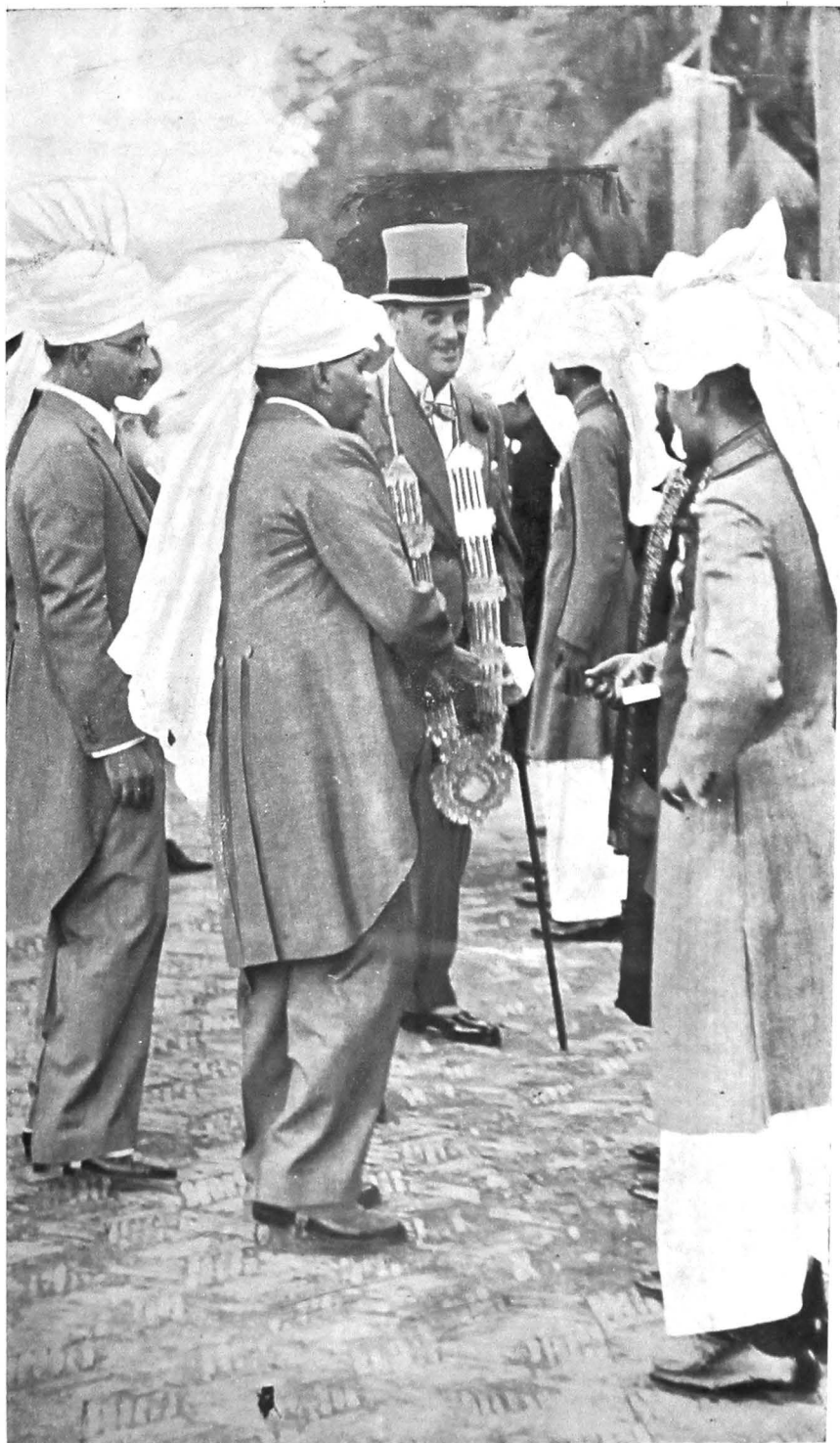
The Premier presenting the hosts to H. E. the Viceroy in Shalimar Gardens, Lahore—See page 21.