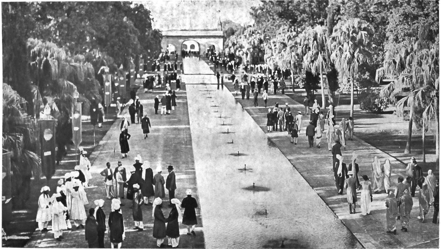
Shalimar Gardens, Lahore, provided a picturesque setting for the party given by the landed gentry of the Punjab to Their Excellencies the Viceroy and Lady Linlithgow—See page 21.