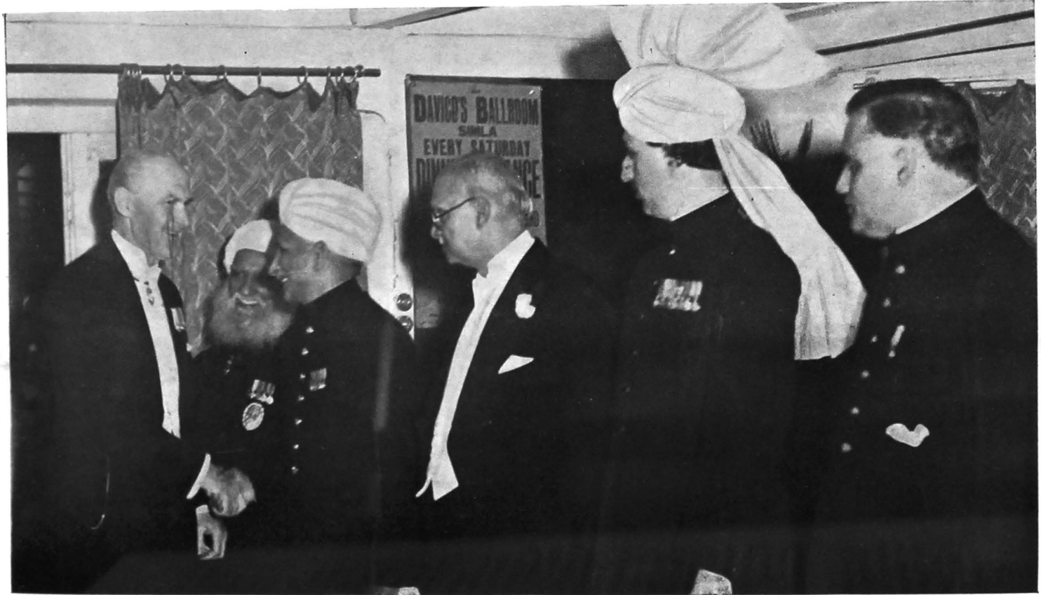
H. E. Sir Henry Craik was entertained at a dinner by the Punjab Ministers in Simla, when the Premier made an important speech—See page 29.