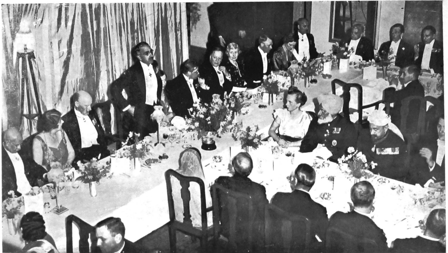
“I hope, the rest of India will not lag behind at this critical juncture”— Sir Sikander Hyat-Khan --See page 30.