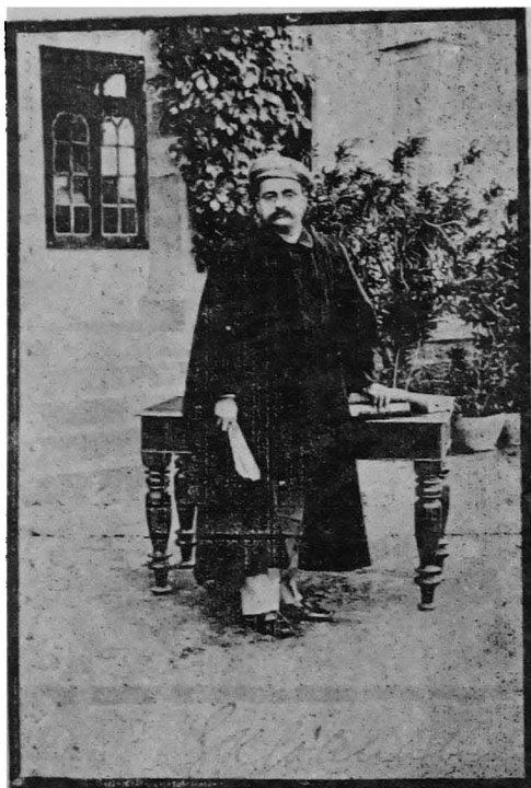
G. K. GOKHALE. In the Professor's Robes.