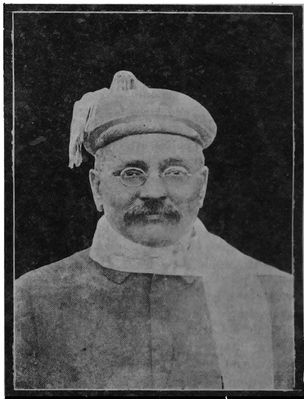
MR. GOKHALE IN SOUTH AFRICA, 1912.