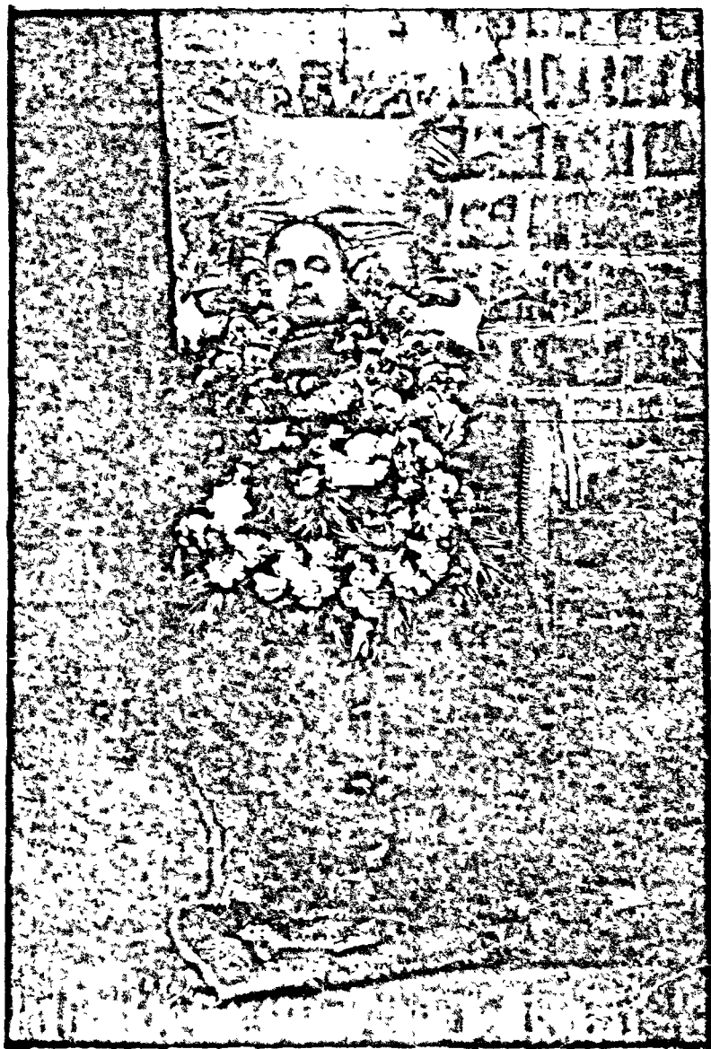
MR G. K. GOKHALE.