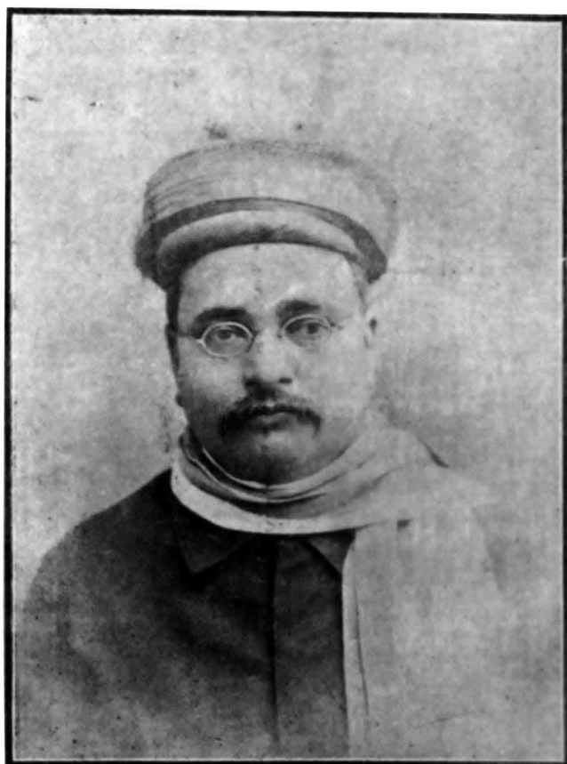
MR. G. K. GOKHALE IN INDIA.