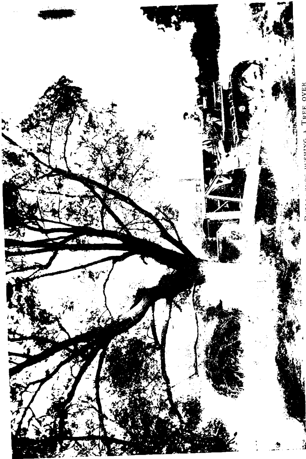
ONE OF JACK OLDING'S SIXTEEN-TON BULLDOZERS PUSHING A TREE OVER