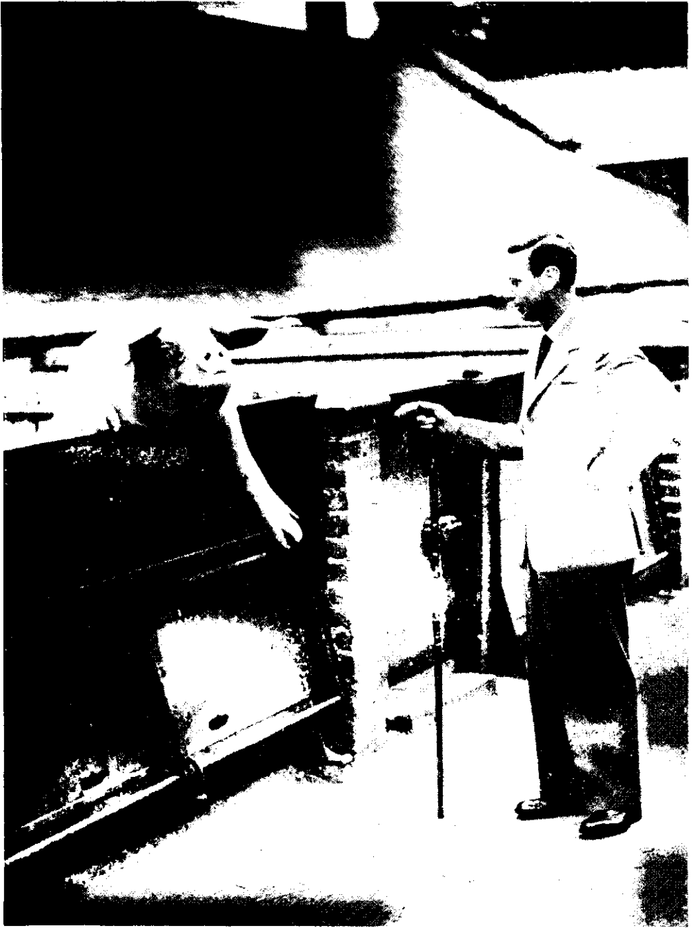
THE SQUIRE OF SANDRINGHAM—KING GEORGE VI