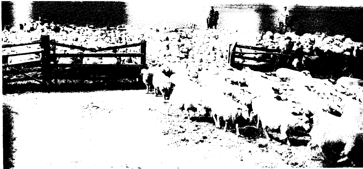
ROUNDING UP SHEEP ON WALLASEA ISLAND "A wild, flat, wide land of bleached grasses and singing winds."