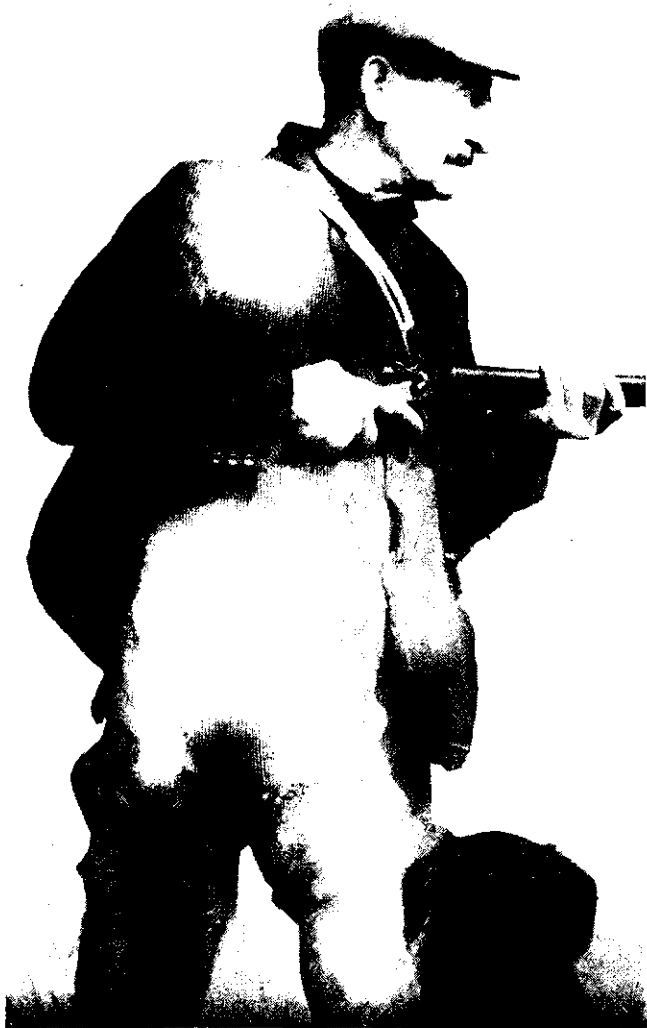
TED ALLEN "A genius of the wild marsh."