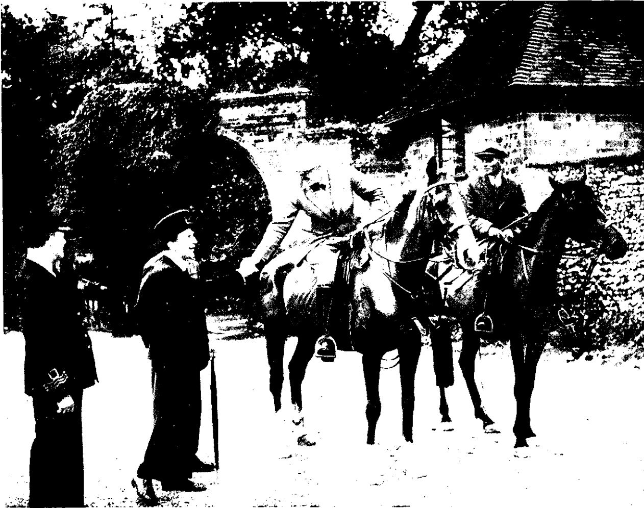
AT HATFIELD HOUSE: VISCOUNT WOLMER (NOW THE EARL OF SELBORNE) AND COMMANDER THE LORD SEMPILL WISHING THE AUTHOR GODSPEED