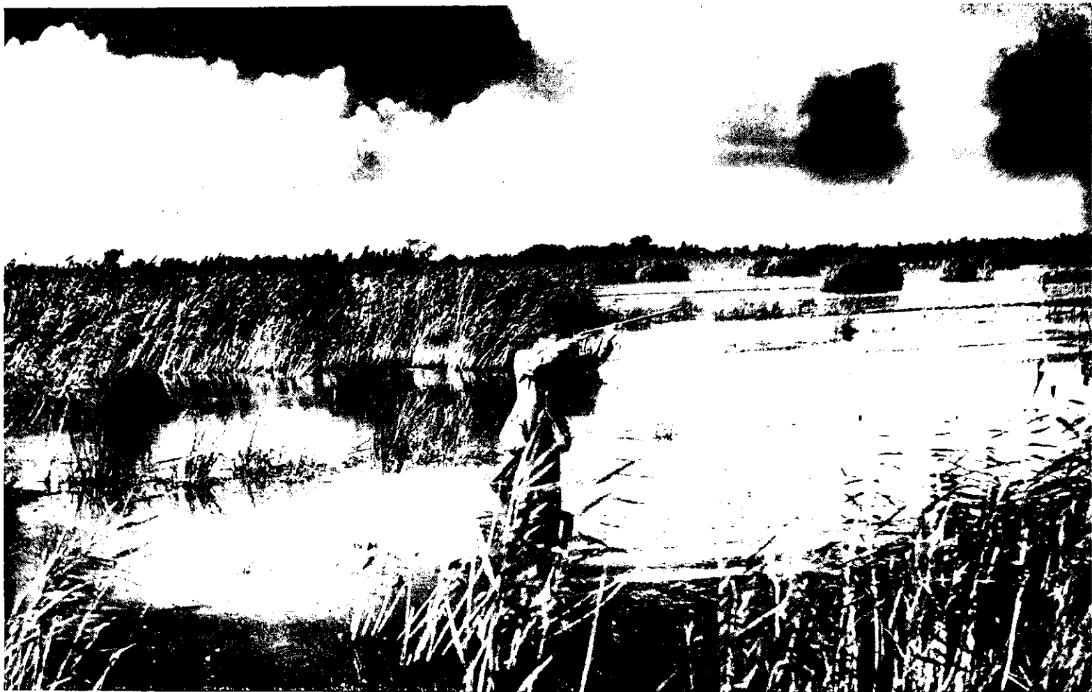
THE AUTHOR SHOOTING DUCK ON SWAN MERE IN 1939

"A rare, enchanted place where bitterns boomed, coots clanked, reed warblers sang, and the redshank sprang on quivering wing, ringing their million bells."