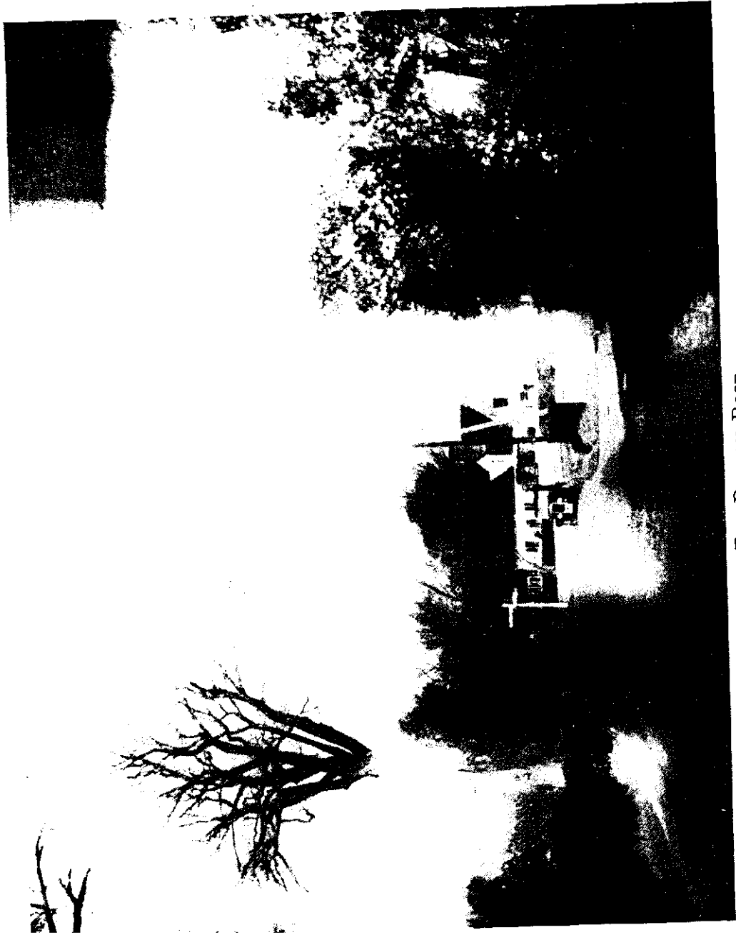
THE PELDON ROSE "That ancient inn . . . sits at its cross-roads like an amiable old witch sunning herself."