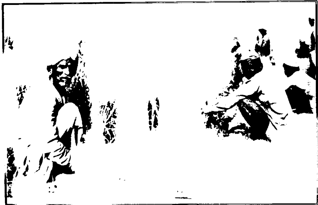
HARVEST TIME IN THE UNITED PROVINCES