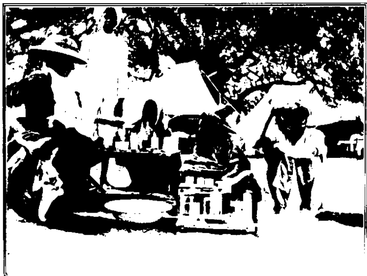
A TRAVELLING MISSION DISPENSARY, WESTERN INDIA