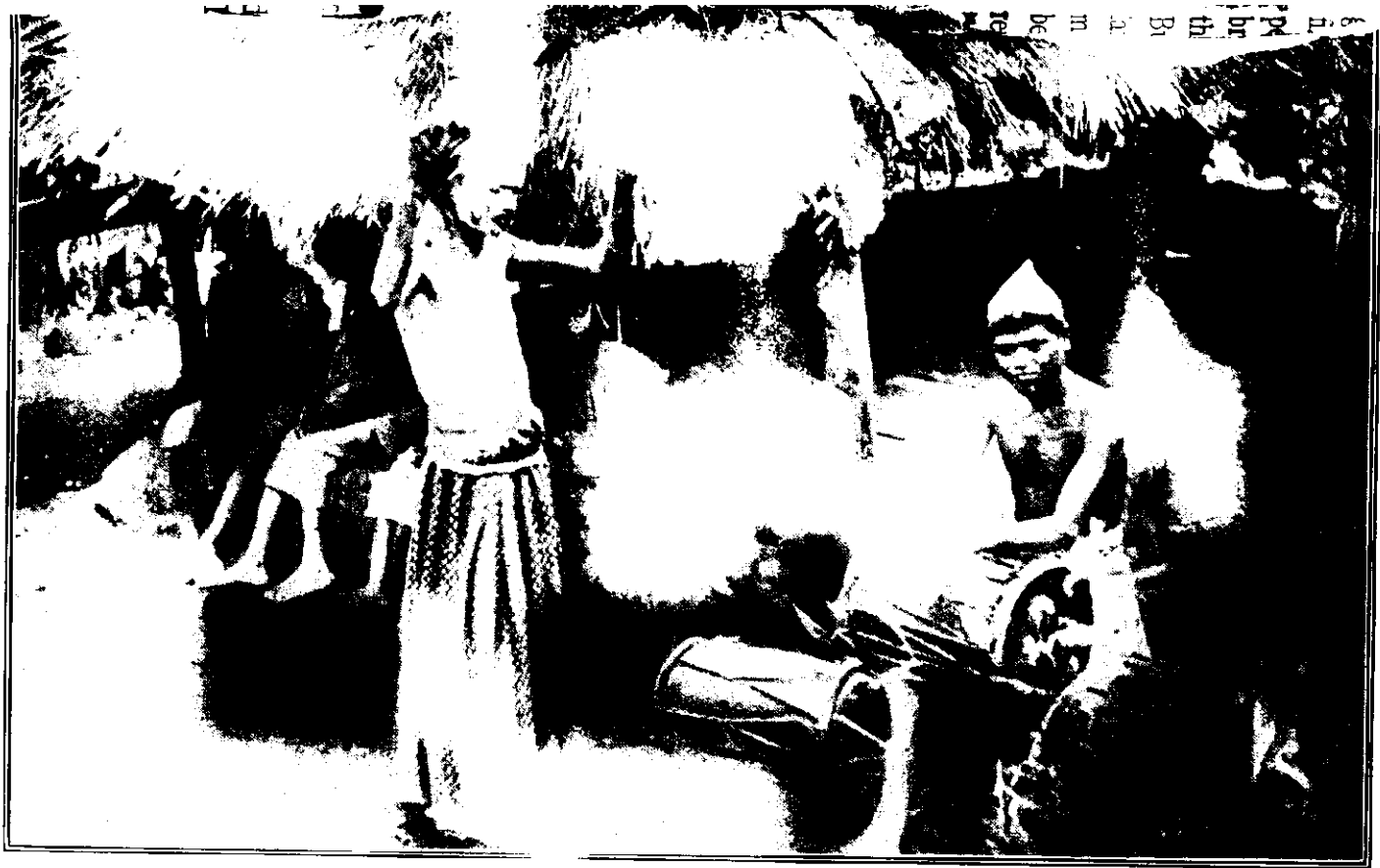
A SORCERER EJECTING A SPIRIT FROM A SICK MAN, TRAVANCORE