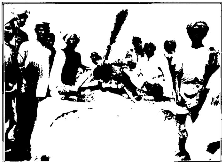
A VILLAGE DEITY, UNITED PROVINCES