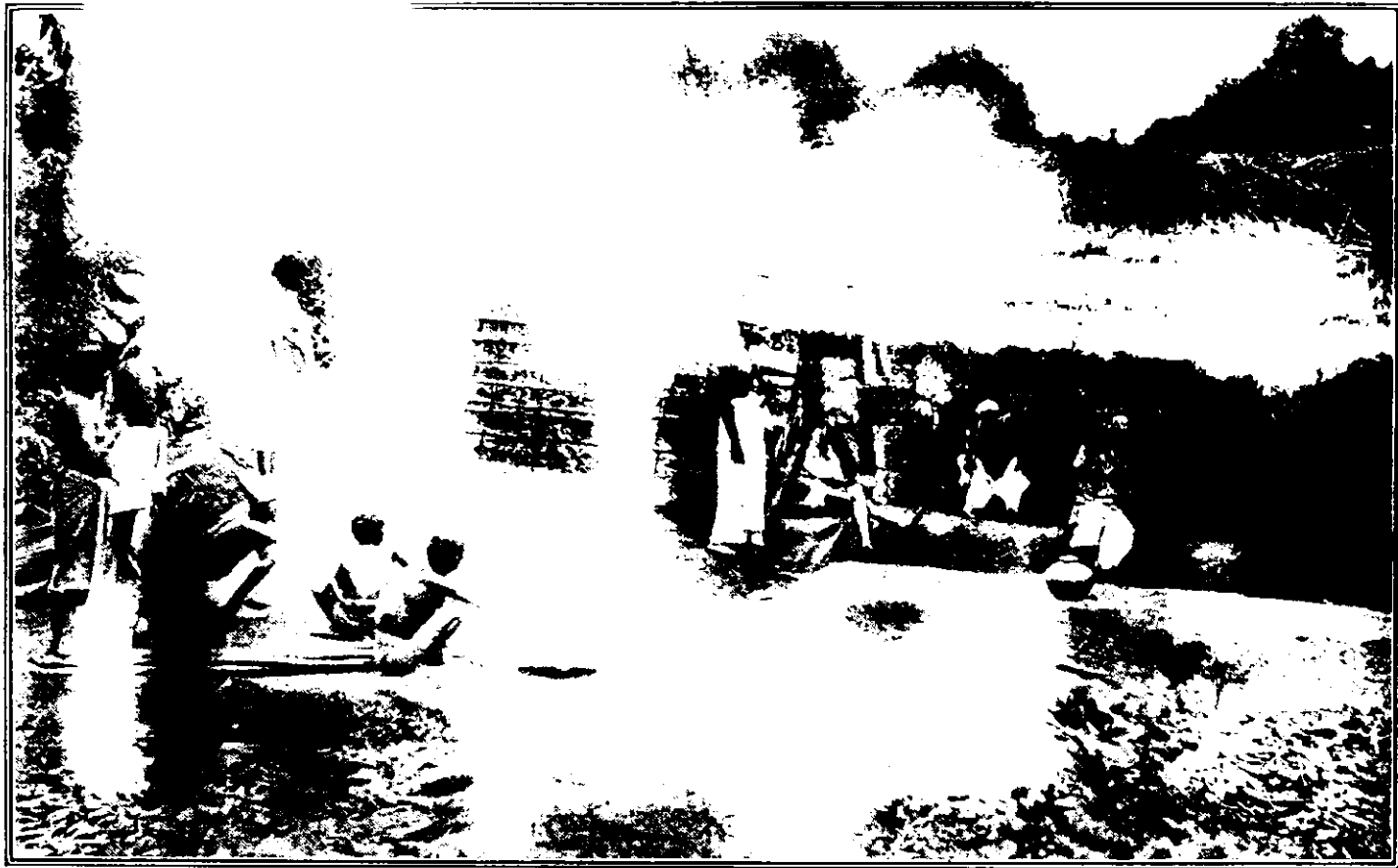
OUTCASTES SHOPPING IN TRAVANCORE