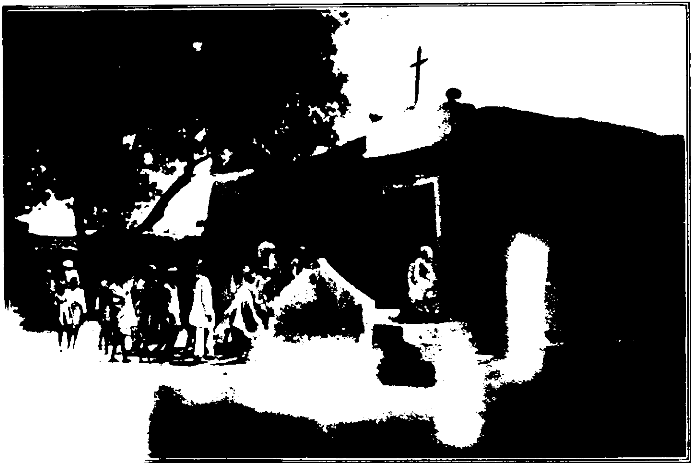
EVENING BELL : A VILLAGE CONGREGATION IN THE UNITED PROVINCES