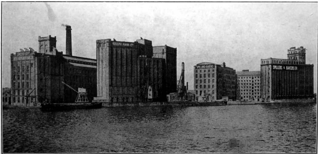
FIG. 1.—Flour mills at Liverpool.