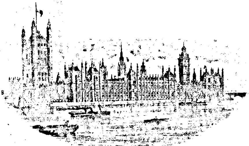
THE NEW PALACE AT WESTMINSTER. THE SEAT OF THE BRITISH PARLIAMENT.

EDINBURGH, W. P. NIMMO, HAY, & MITCHELL.