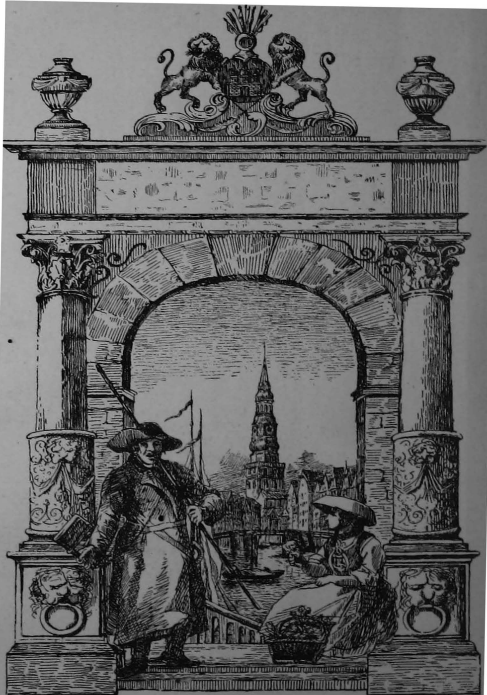
VIEW OF HAMBURG.