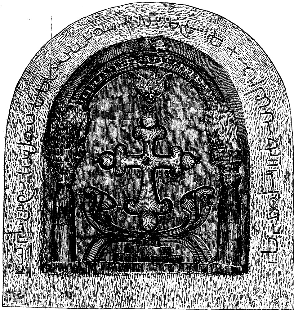
THE OLDEST CHRISTIAN INSCRIPTION IN INDIA—SEVENTH CENTURY