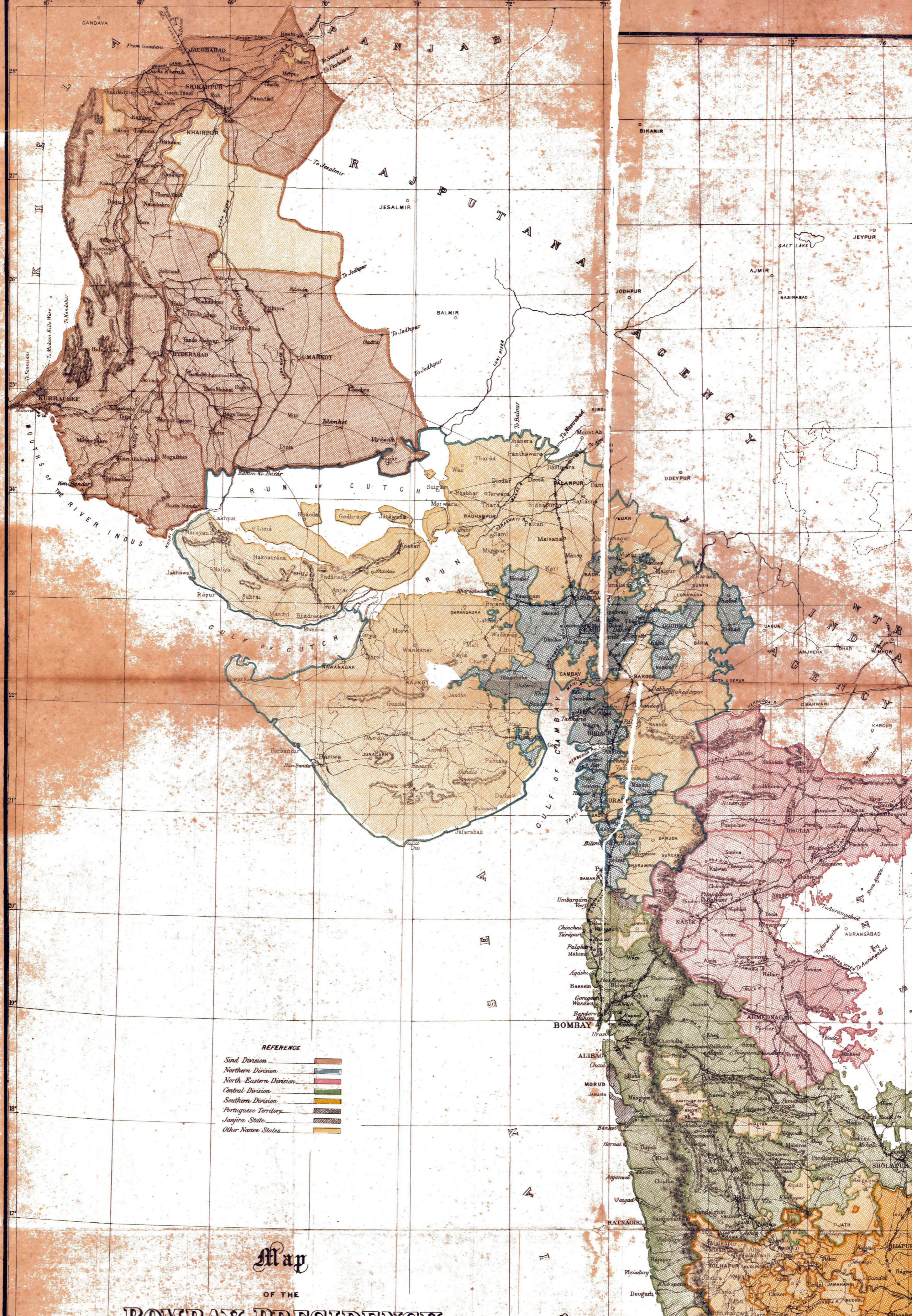
Map OF THE BOMBAY PRESIDENCY