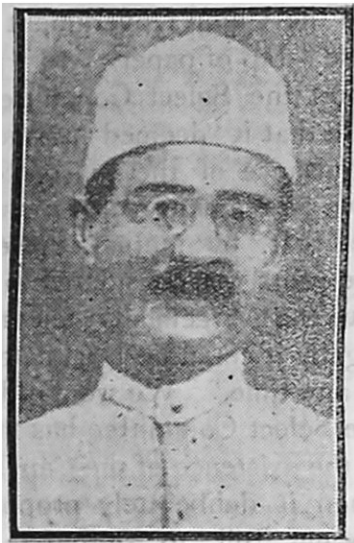
Sjt. Mahadeo Desai.

S JT. MAHADEOBHAI DESAI is Mahatma Gandhi's Secretary and has been acting in that capacity for the last twelve years. He is a graduate of the Bombay University. Although an L.L.B. he has never practised in the courts. He is living in the Satyagrah-ashram with his family. The general Indian public has no idea of the tremendous amount of work that falls on Mahatma Gandhi's secretary. Mahatma Gandhi receives daily a large post bag and letters from all the parts of the world. Besides attending to the voluminous correspondence, Mr. Mahadeobhai has to write for Navjivan a weekly Gujrati edited by Gandhiji. He has also to translate Mahatmaji's original Gujrati articles into English for Young India a weekly English also edited by Mahatma Gandhi. Mr. Mahadeobhai has travelled throughout India with Mahatma Gandhi and his writings in Navjivan depict in beautiful language the progress of Mahatmaji's tour. Sardar Vallabhbai Patel often uses Mahadeobhai as his secretary too. Mahadeobhai does not lag behind in giving his time to all public activities of Gujrat. He is one of the secretaries of the Gujrat Provincial Congress Committee. During the great non-co-operation movement of 1921 Mr. Mahadeobhai Desai went to Allahabad at the invitation of Pundit Motilal Nehru to edit his English paper Independent . Mahadeobhai was arrested by the U.P. Government for sedition and sentenced to one year's simple imprisonment. He is a fine