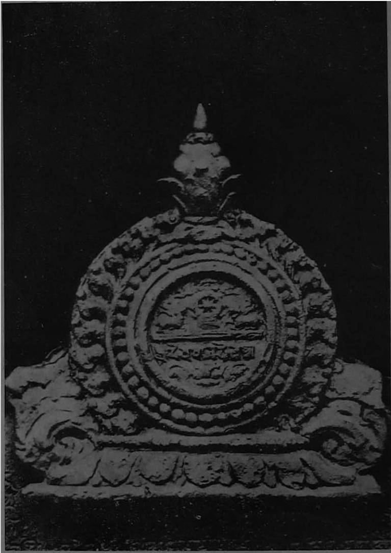
THE SEAL OF DEVAPALADEVA with Dharmachakra and two gazelles on each side. Probably adopted by the University of Nalanda as its official seal ( cf. HIRANANDA SASTRI, Ep. Ind. , XXI, p. 73)