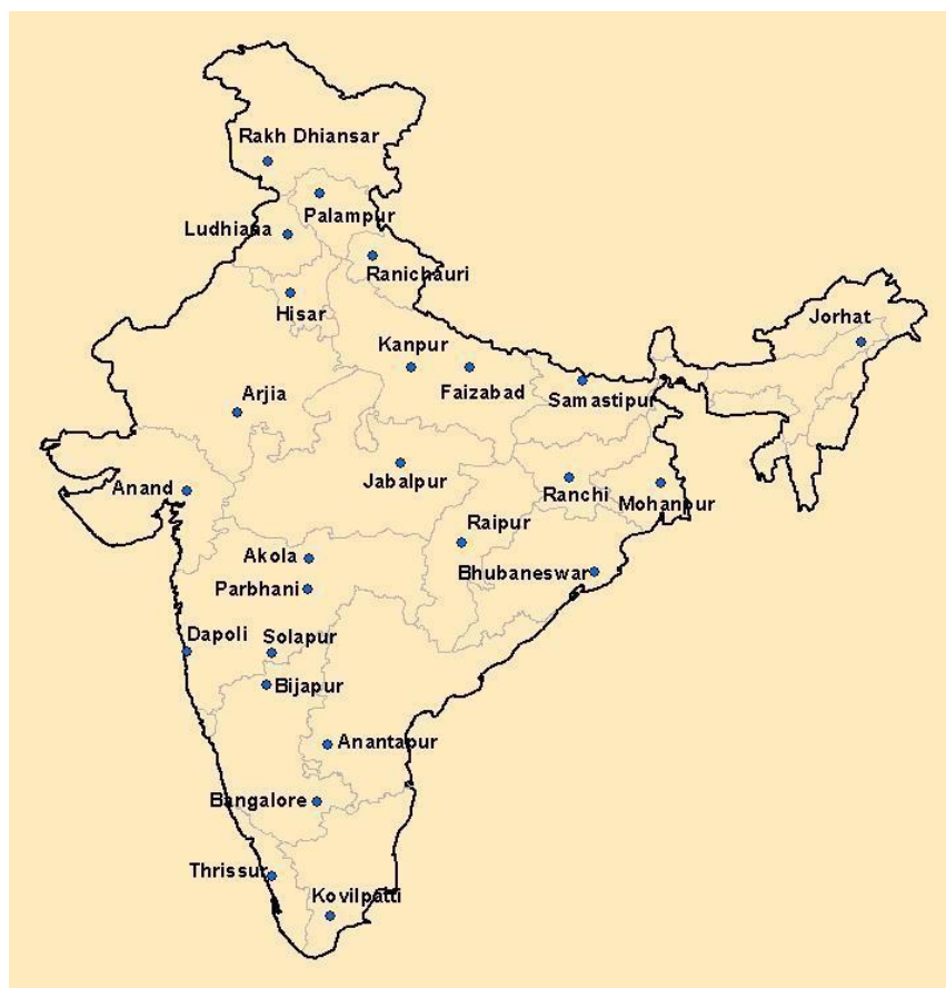
FIGURE 2: MAP SHOWING SPATIAL DISTRIBUTION OF SELECTED METEOROLOGICAL OBSERVATORIES IN THE COUNTRY